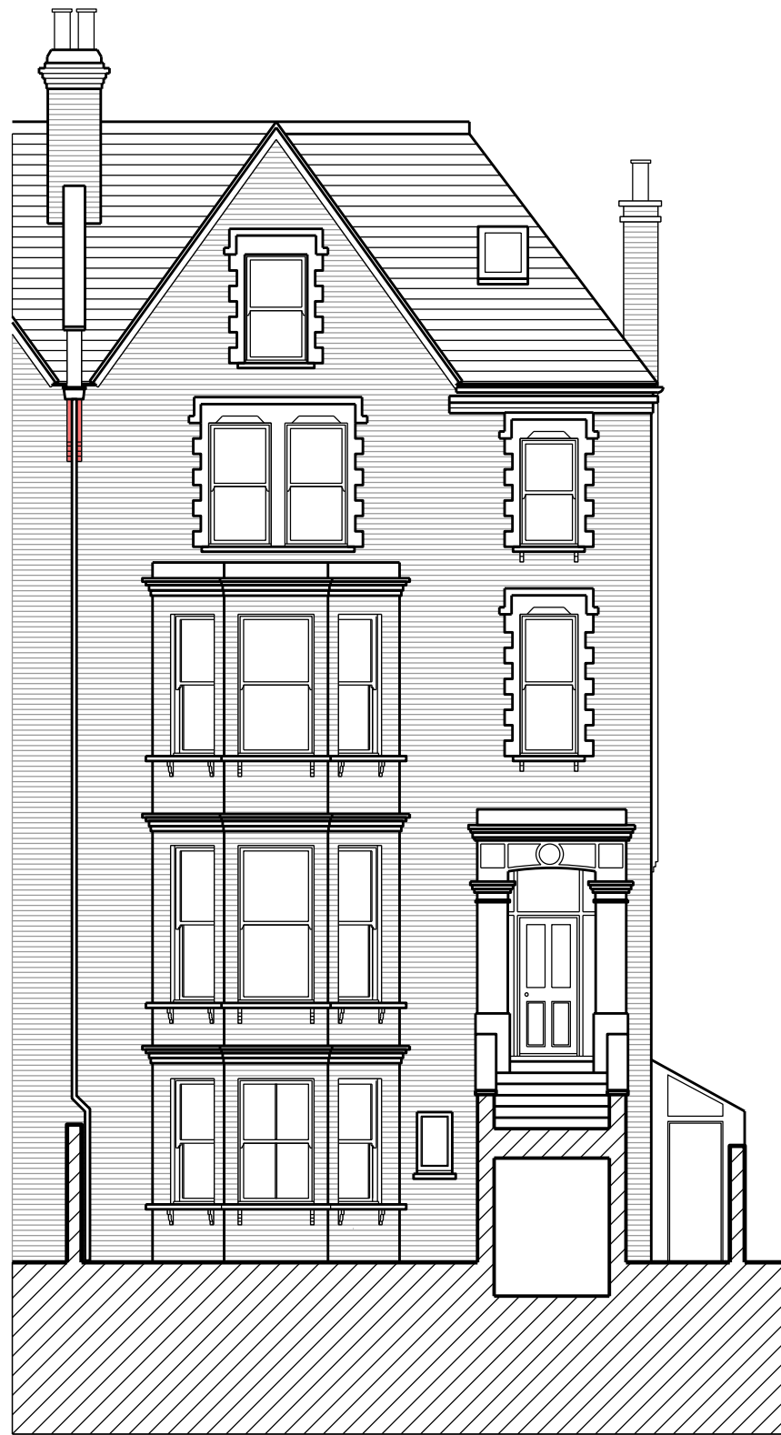
01 Existing Front (SW) Elevation Scale 1:100