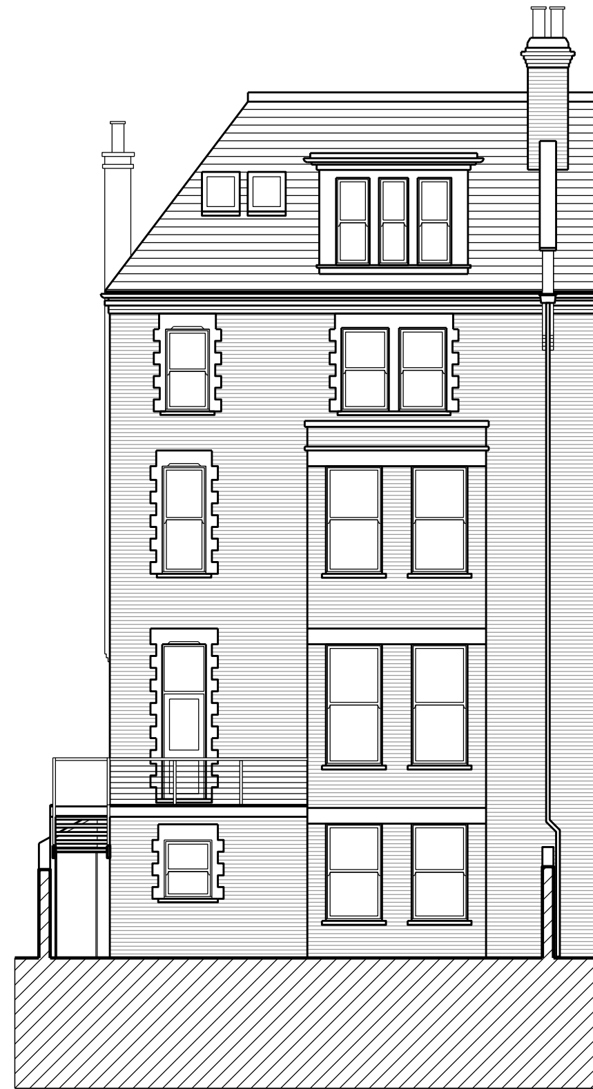
02 Existing Rear (NE) Elevation Scale 1:100