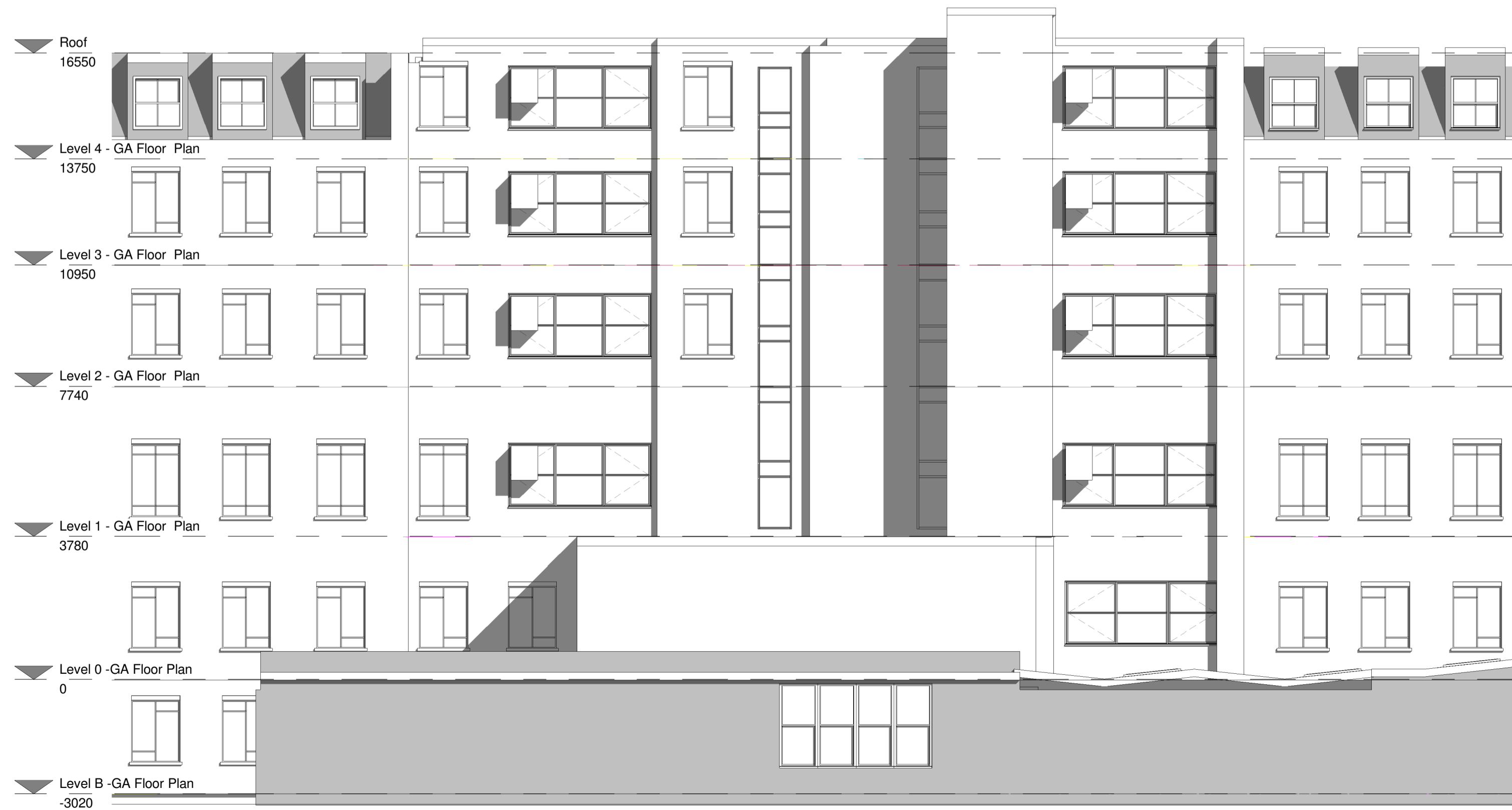
1 South West 100 Existing 1 : 100