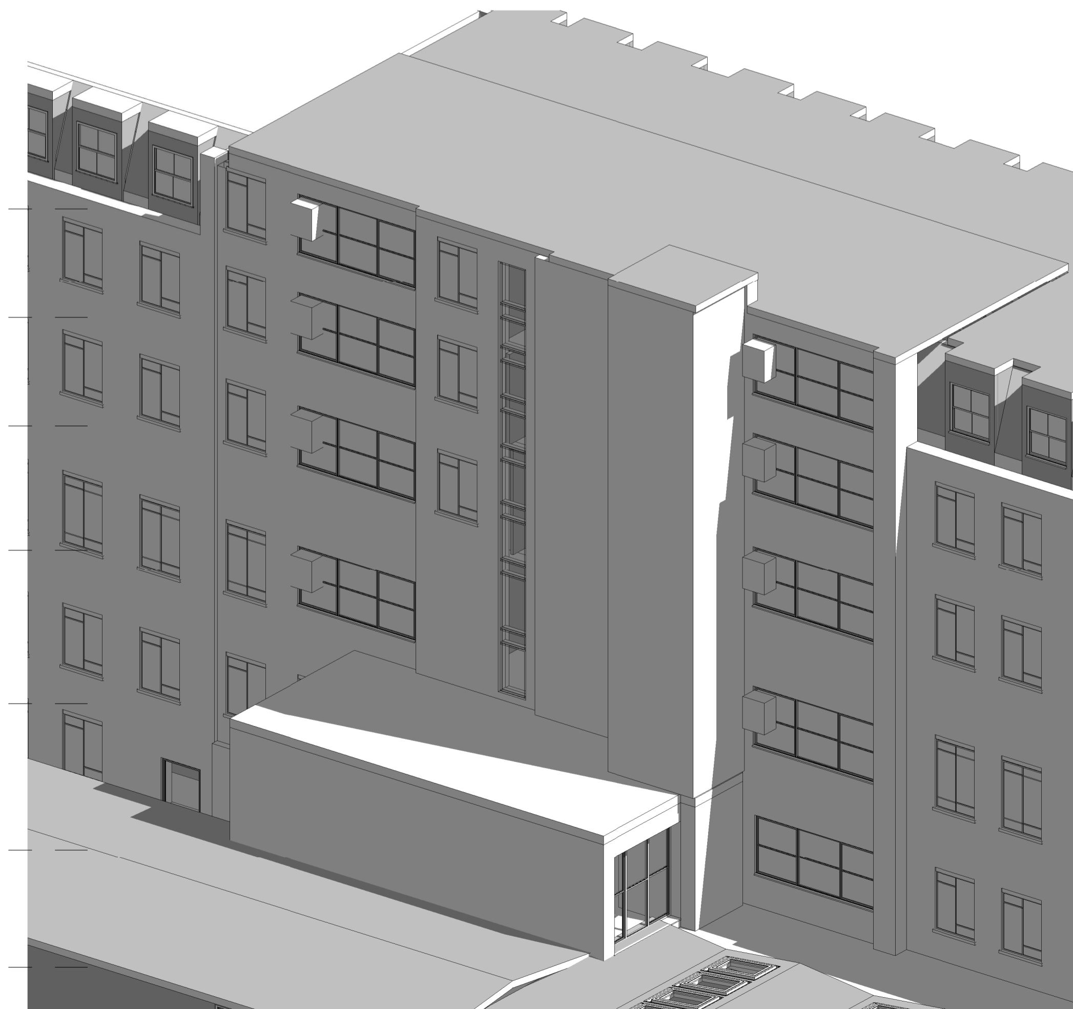
3 South West Elevation 100 Existing