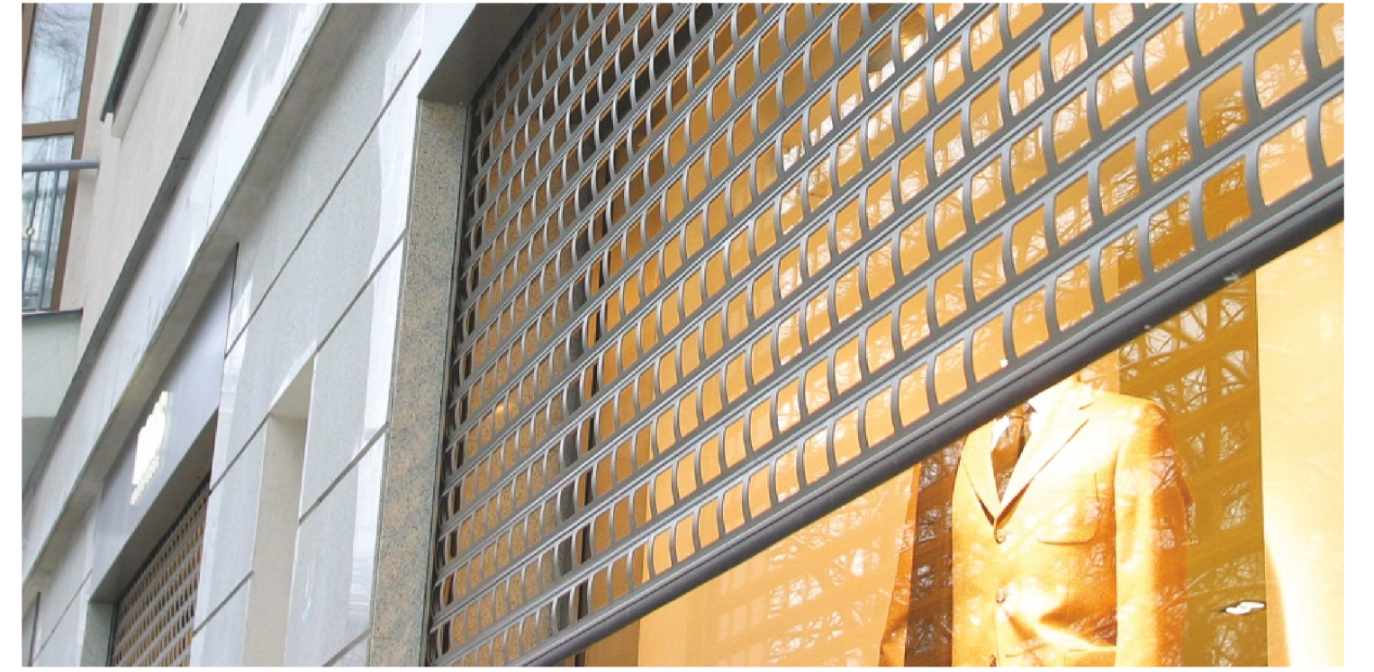
04 Perforated Roller Grille Reference Image