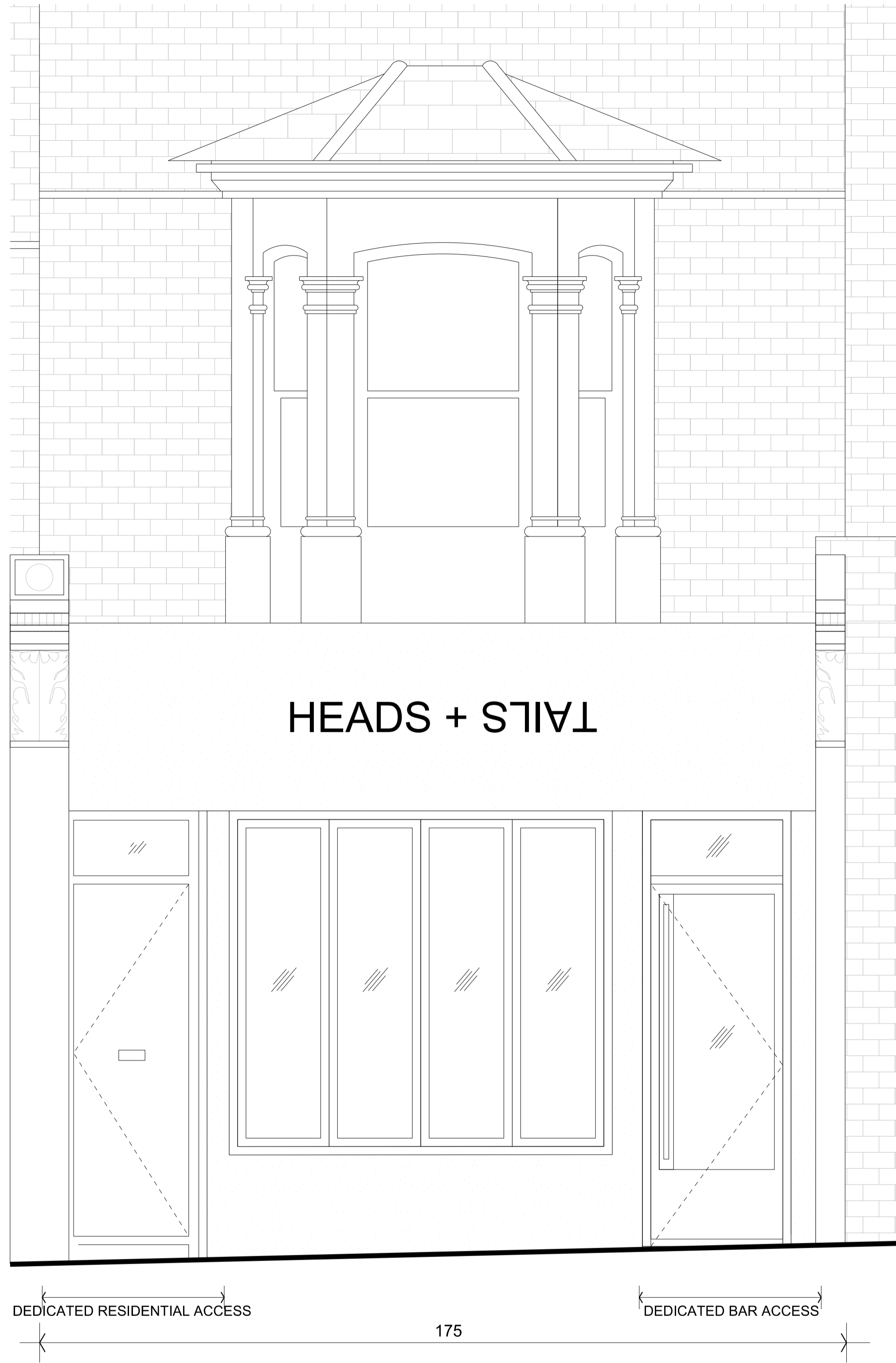
01 Existing Elevation