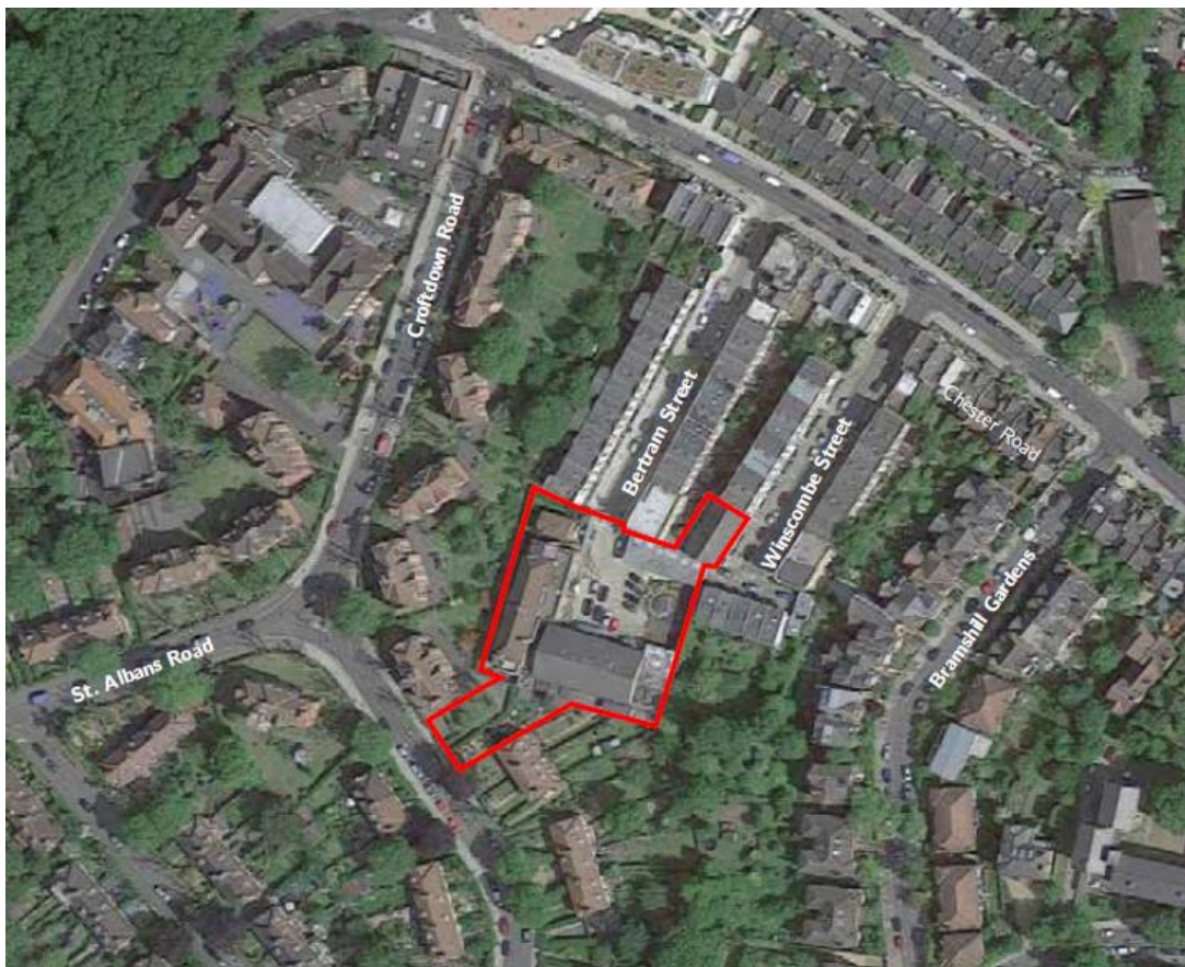
Figure 2.1 Site Location Plan