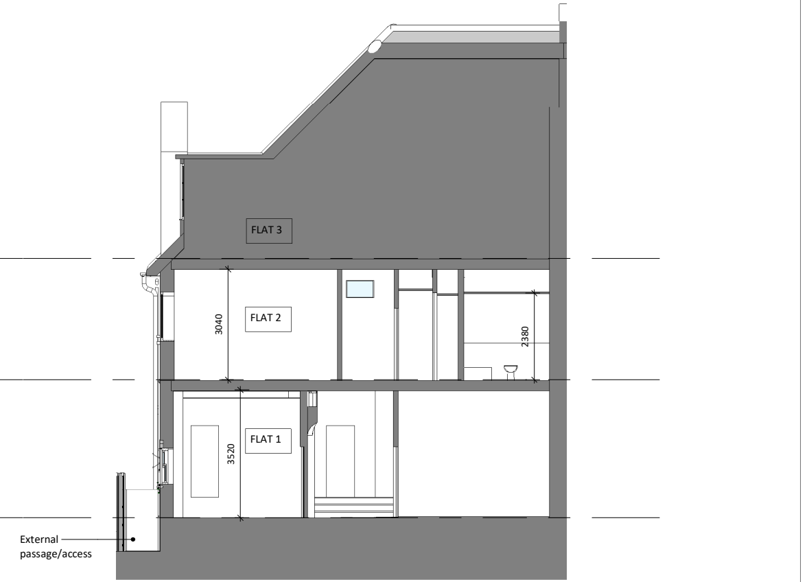
3 Existing Section CC 1:200.101 1:100