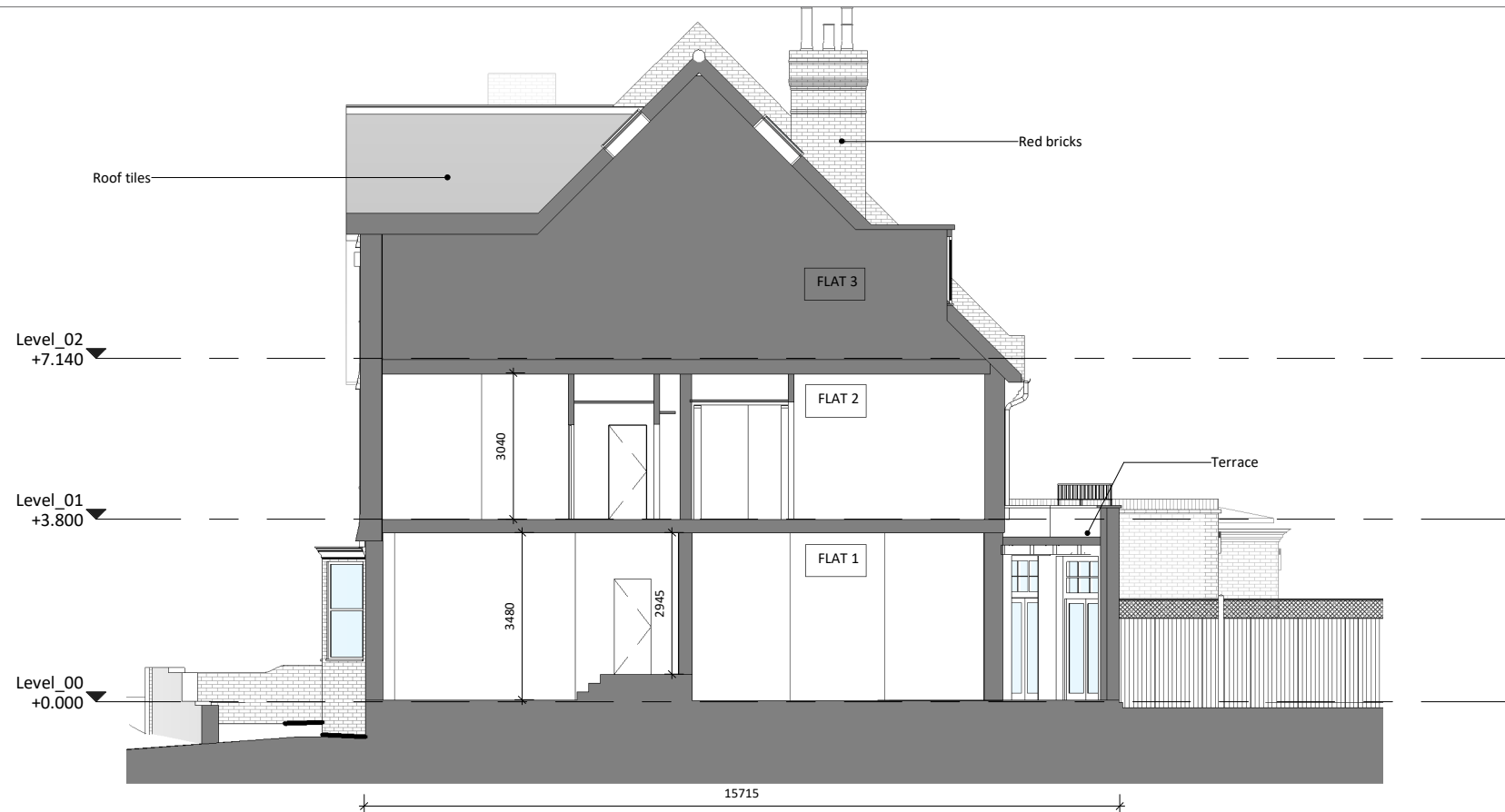
1 Existing Section AA 1:200.101 1:100