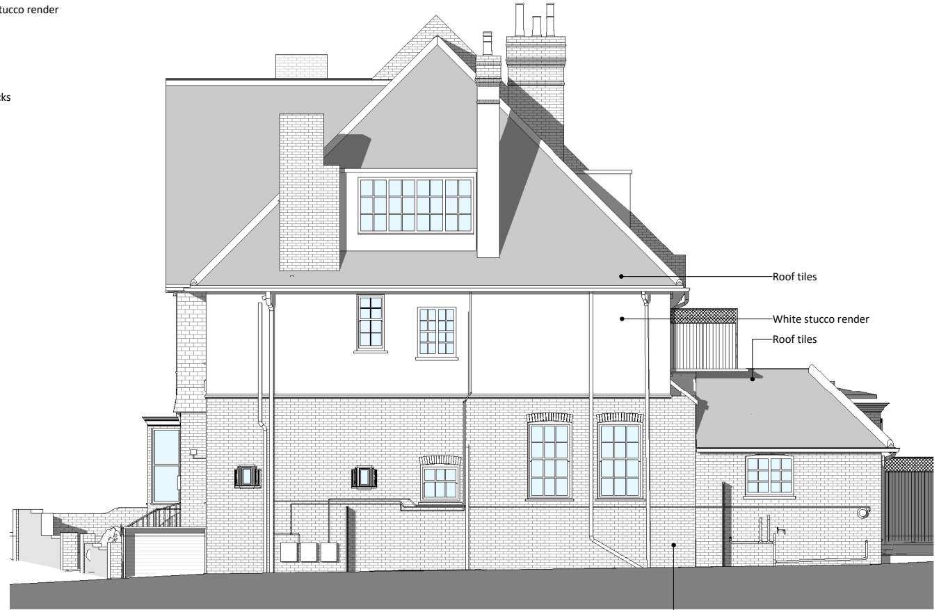
3 Existing Side Elevation 1 : 100