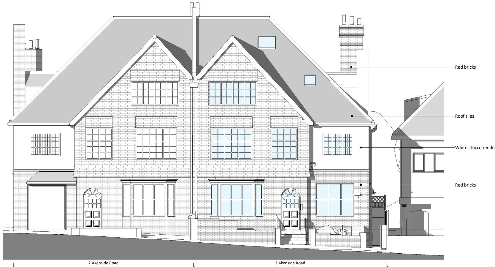
1 Existing Front Elevation 1 : 100