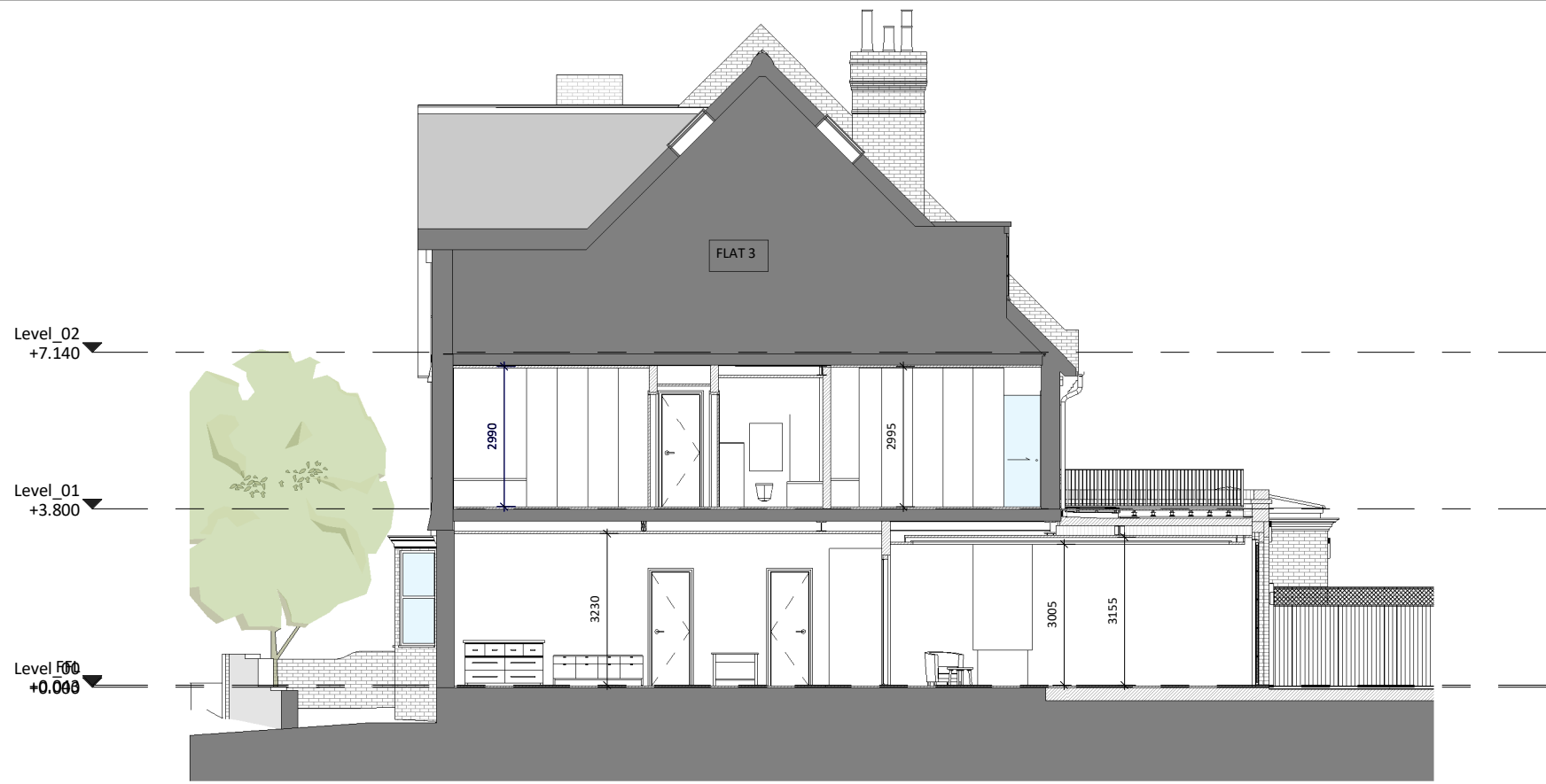
1 Proposed-Section AA 3.200.102 1 : 100