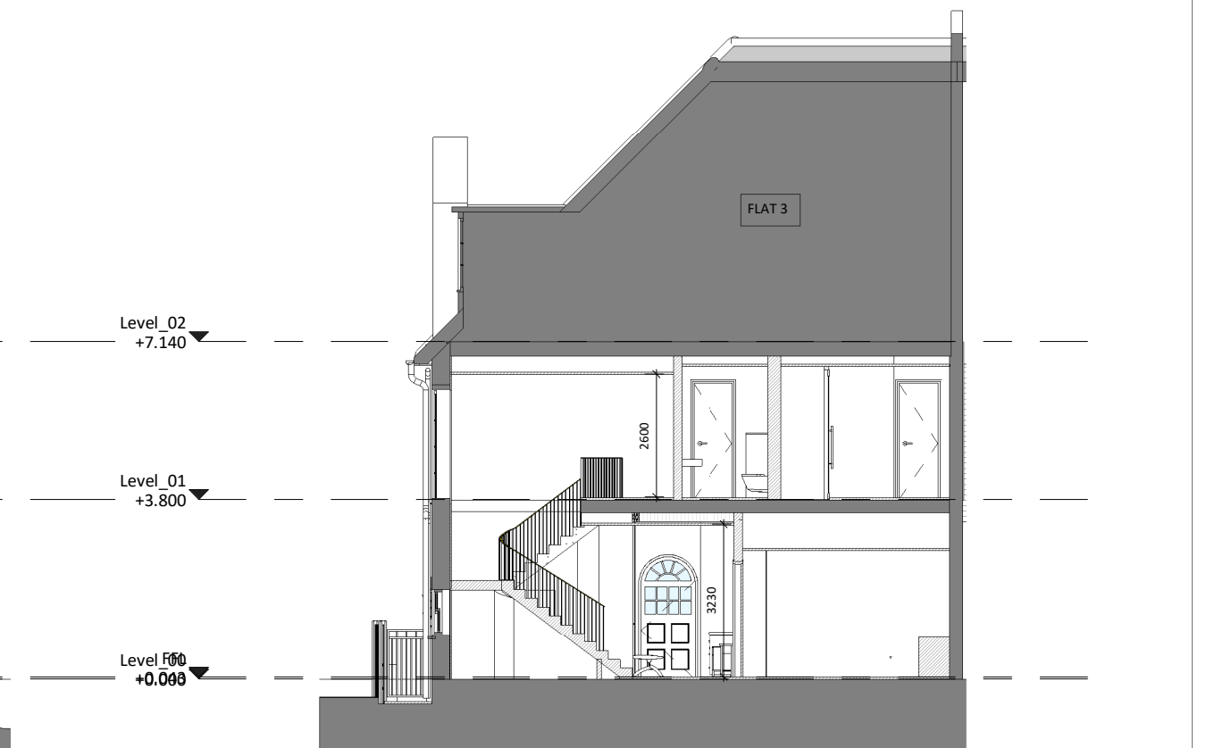
3 Proposed-Section CC 3.200.102 1 : 100