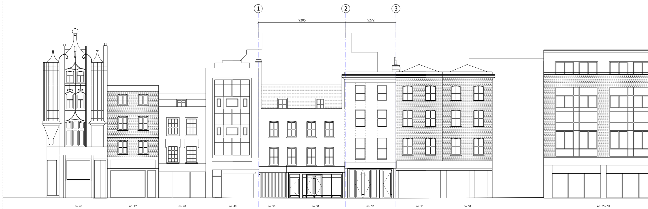
01 PROPOSED FRONT ELEVATION