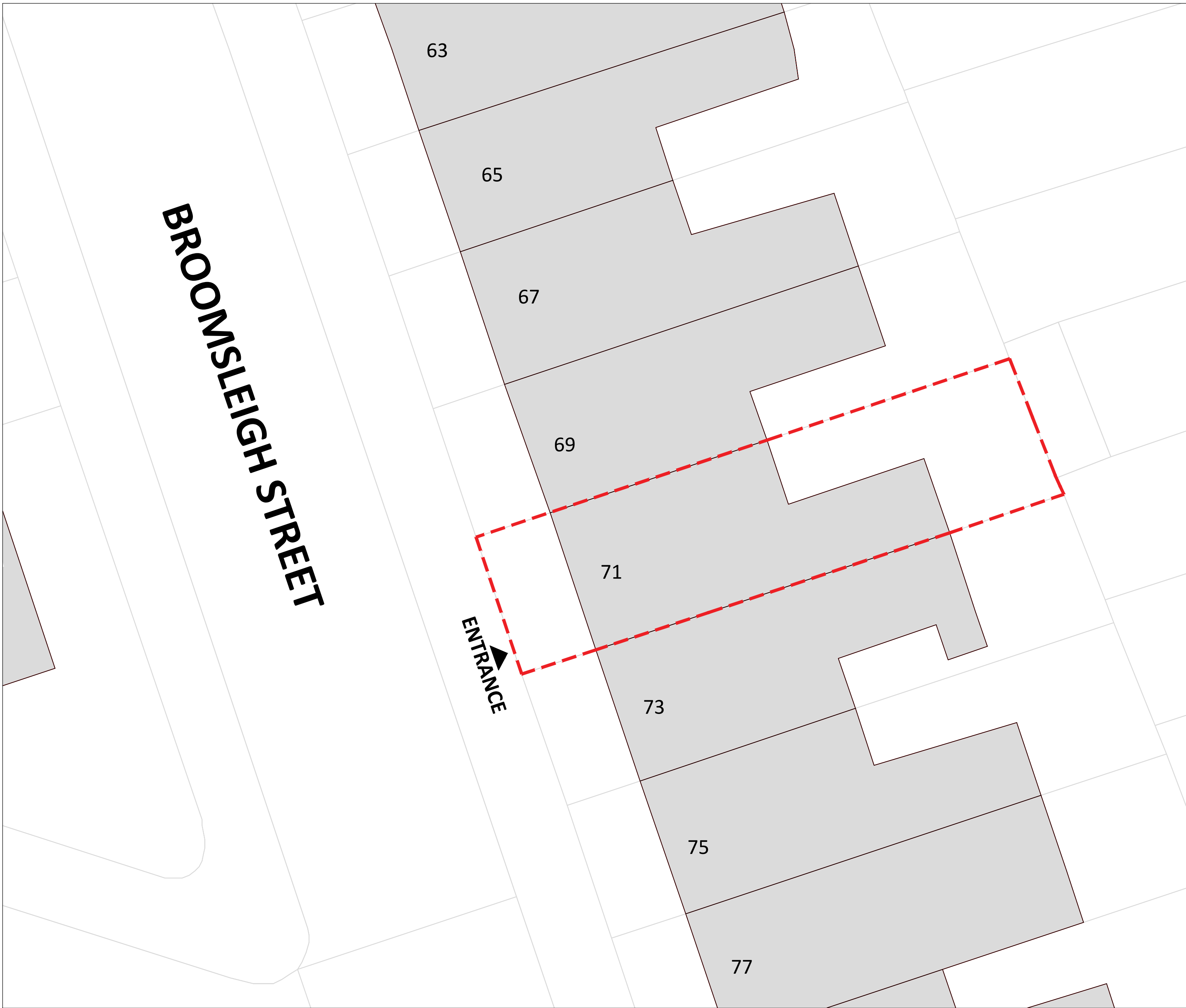
L(0-)010.01 Existing and Proposed Site Plan