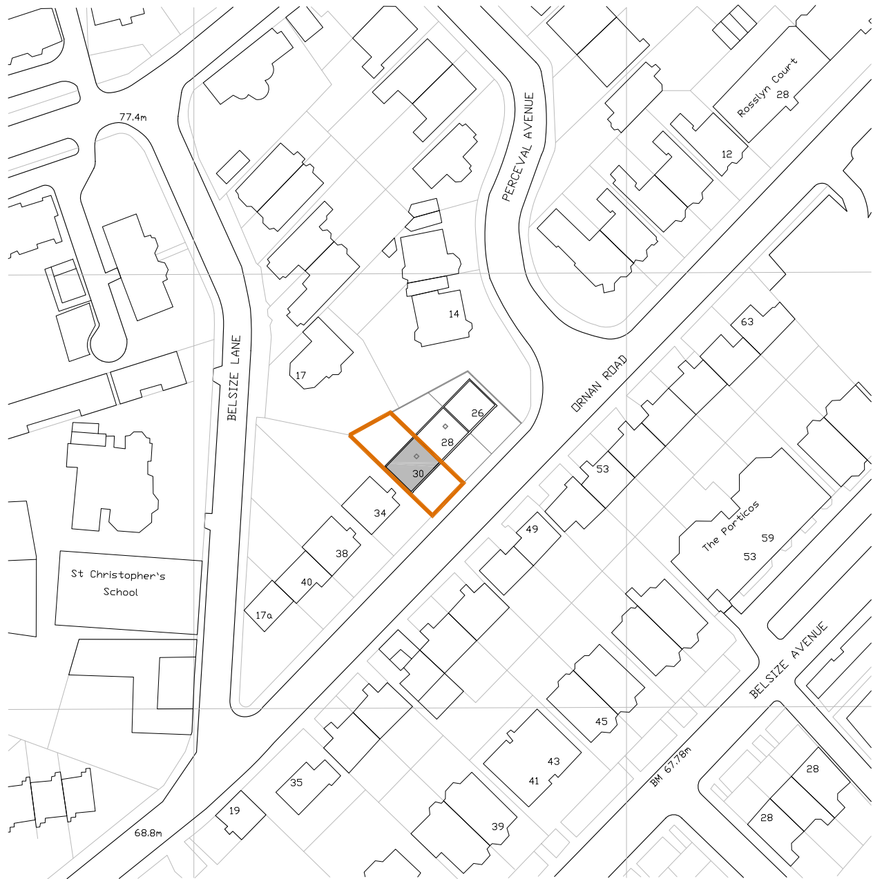
EXISTING Location Plan SCALE 1:1250@A3 LP-01