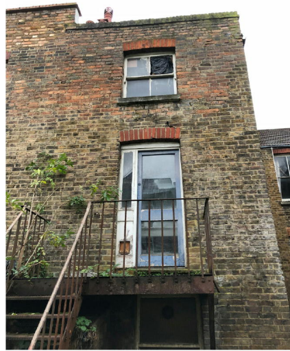
Fig.2 Photograph of rear elevation