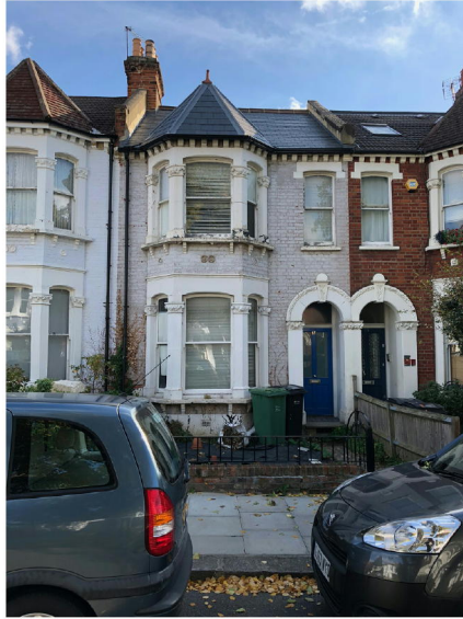
Fig.1 Photograph of front elevation