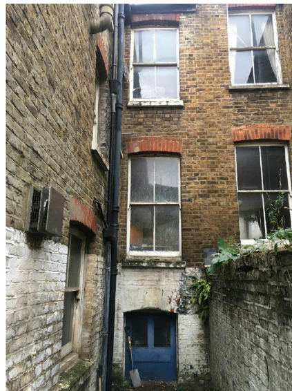
Fig.3 Photograph of side passage