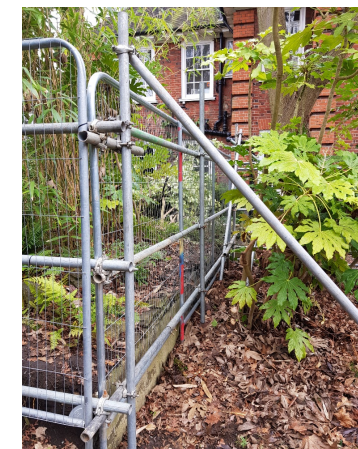
2019/0137/NEW – Supplementary Plan Photographic view points for Tree Protection Fencing 15 Greenaway Gardens Condition 5 of 2015/5074/P