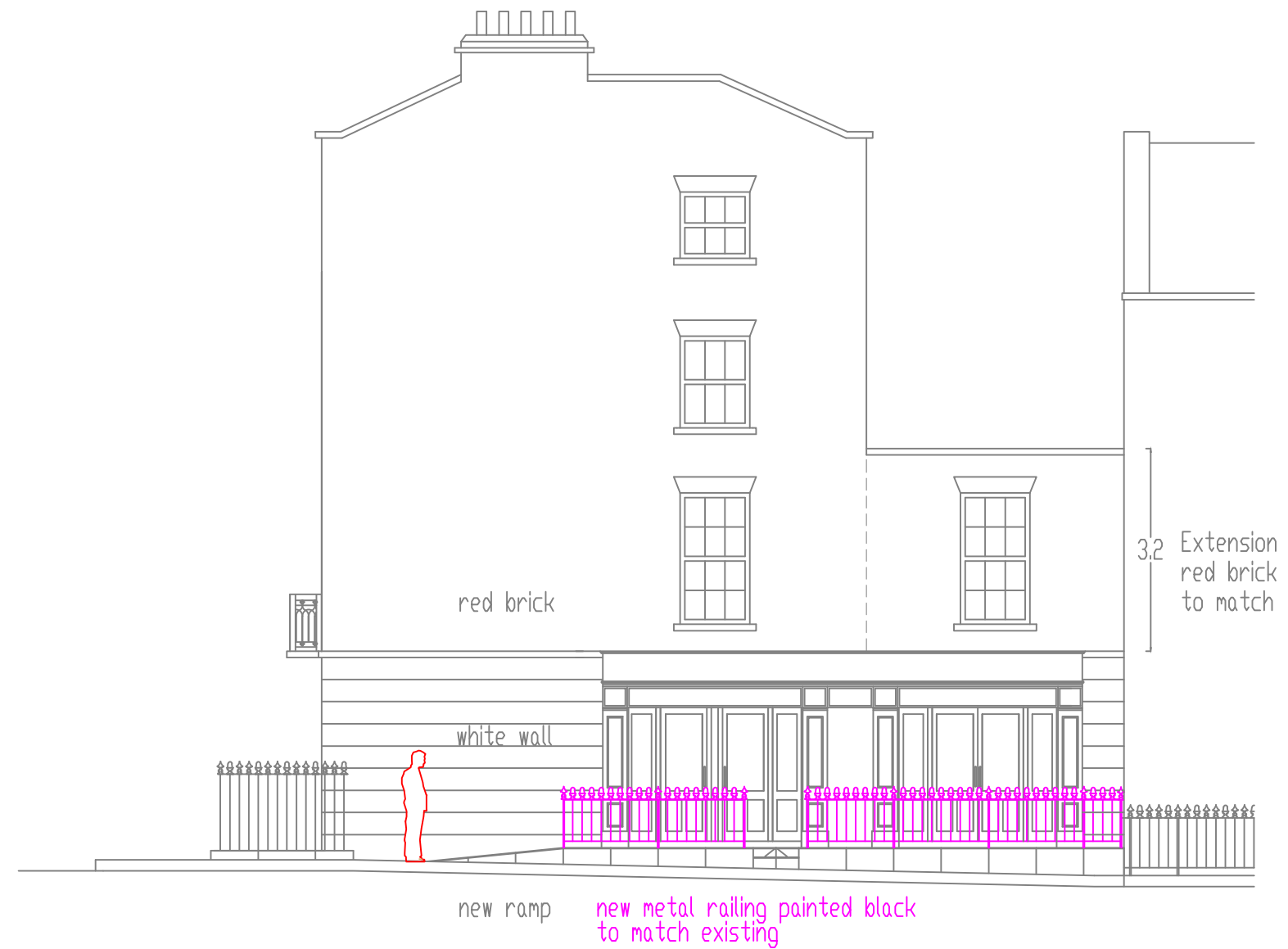
PROPOSED DRUMMOND STREET ELEVATION