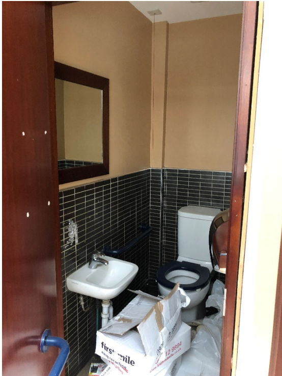
Ground Floor toilet