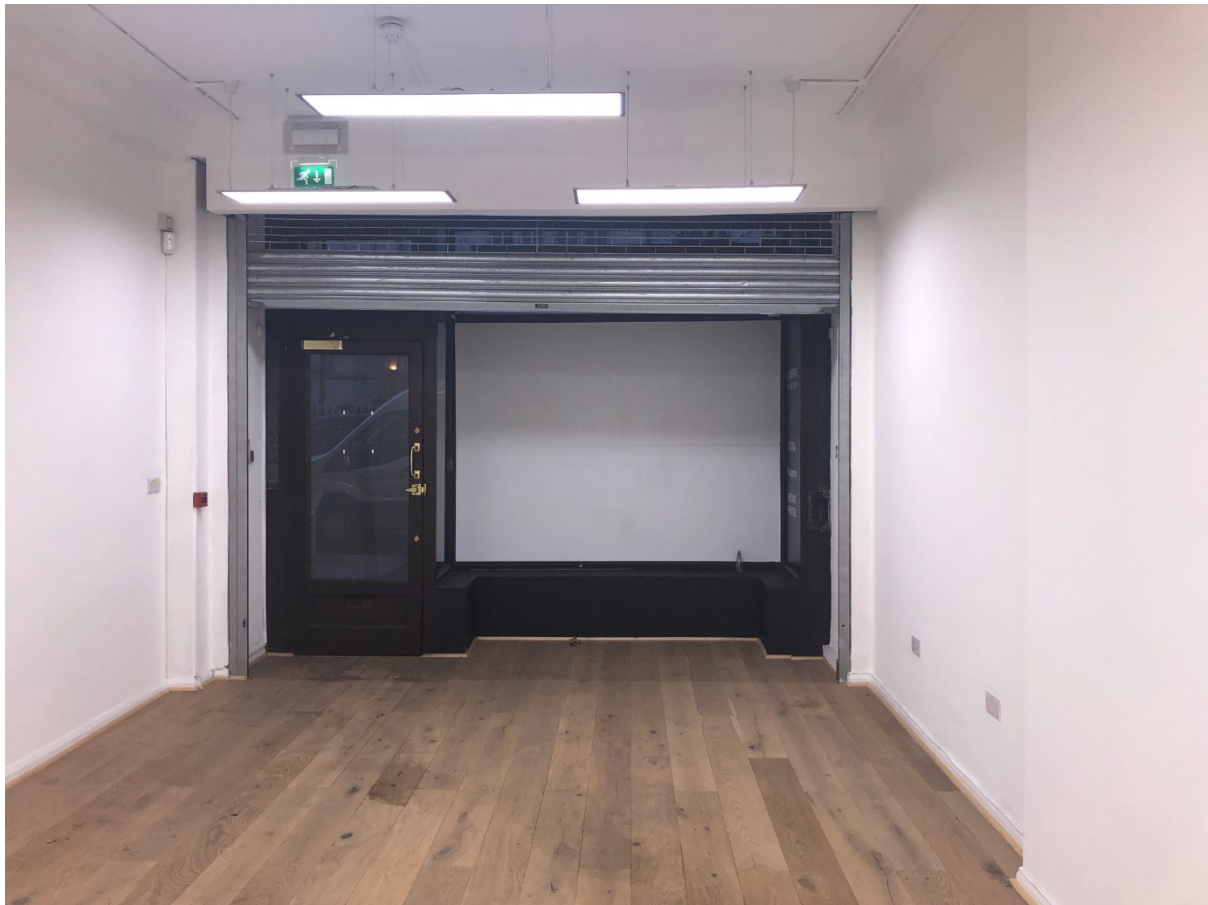
29 towards shopfront