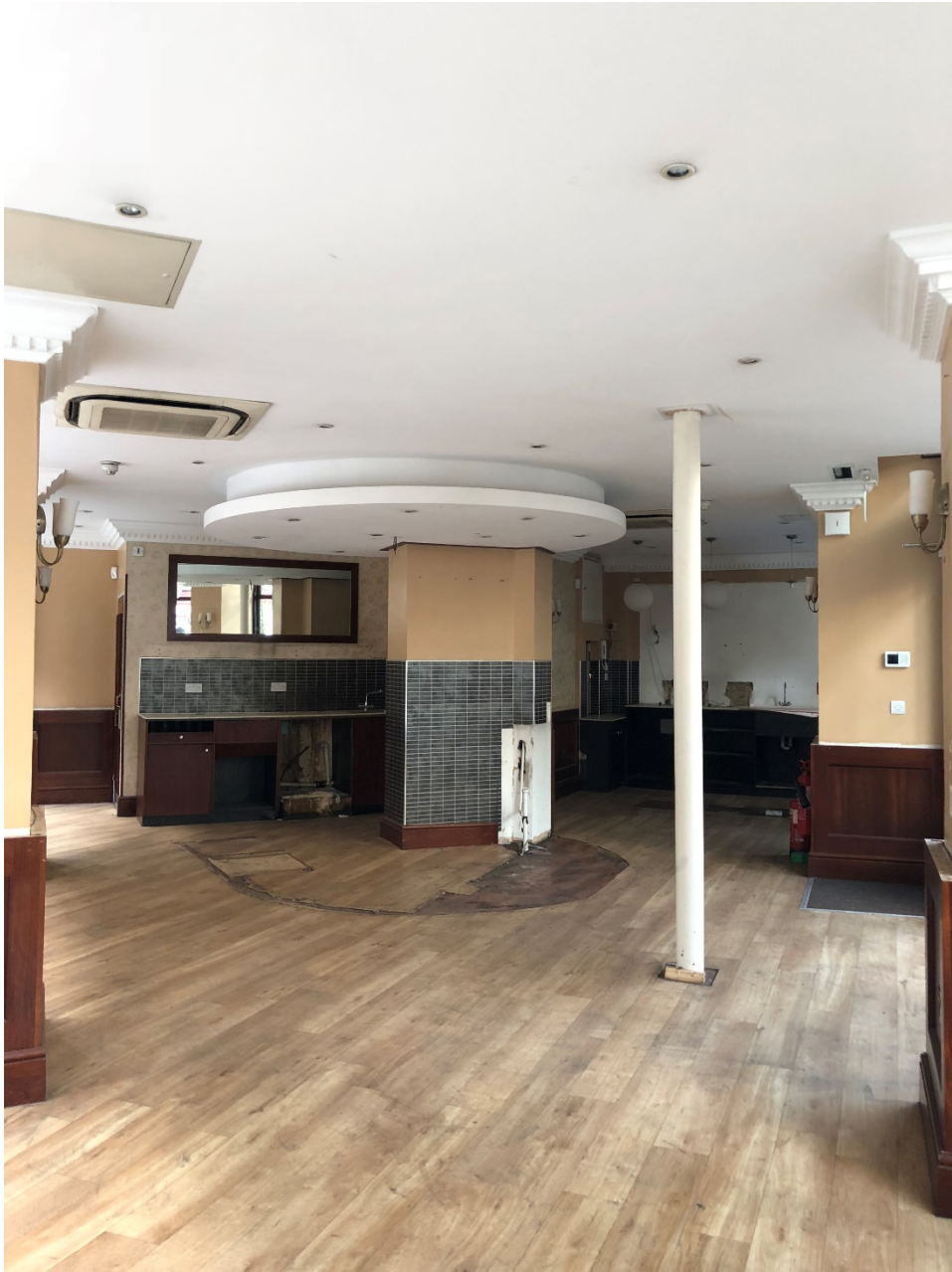
Ground Floor looking north