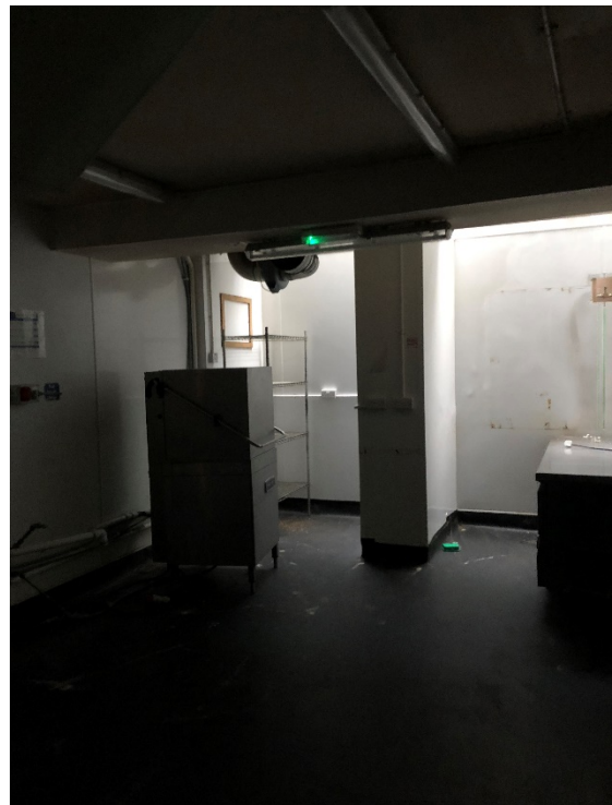
Basement northern room (party wall with 29)