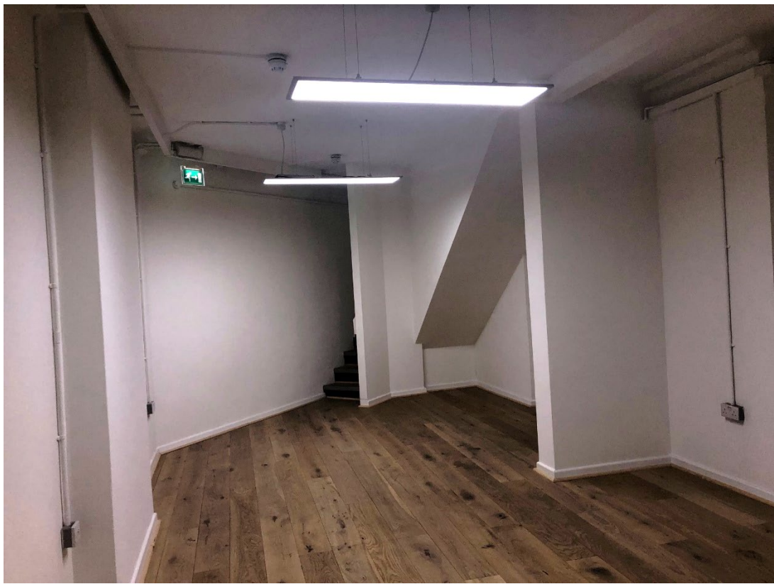
Basement towards rear