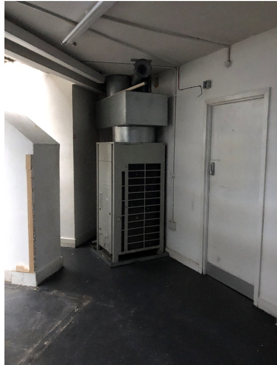
Basement ventilation system