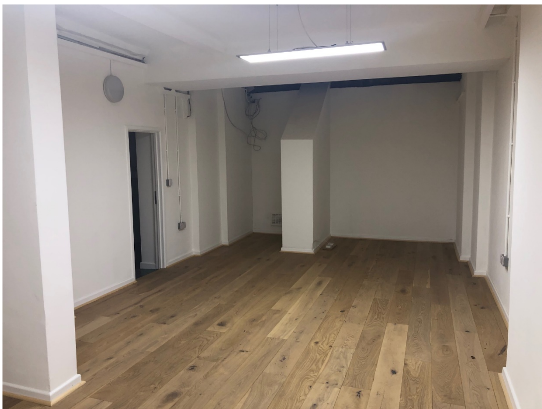
Basement towards street side