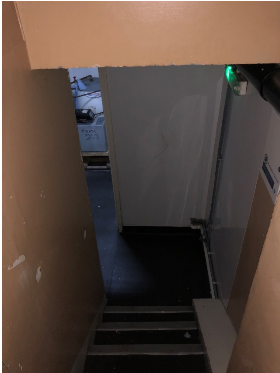
Stairs to basement