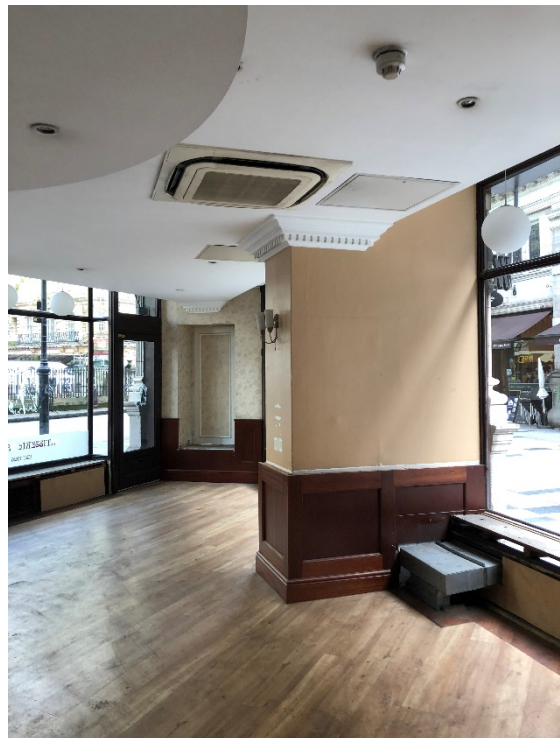
Ground Floor looking south