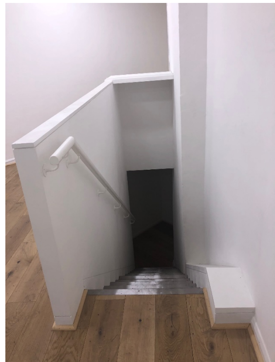
Stairs to basement