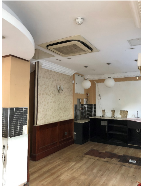
Ground Floor looking northwest