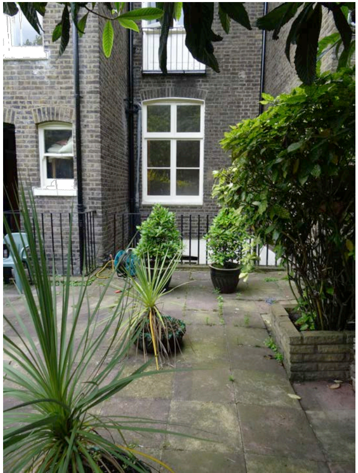
Above: Existing Rear Garden of 24 Montague Street Below: Existing Rear Garden Lightwell to 23 Montague Street