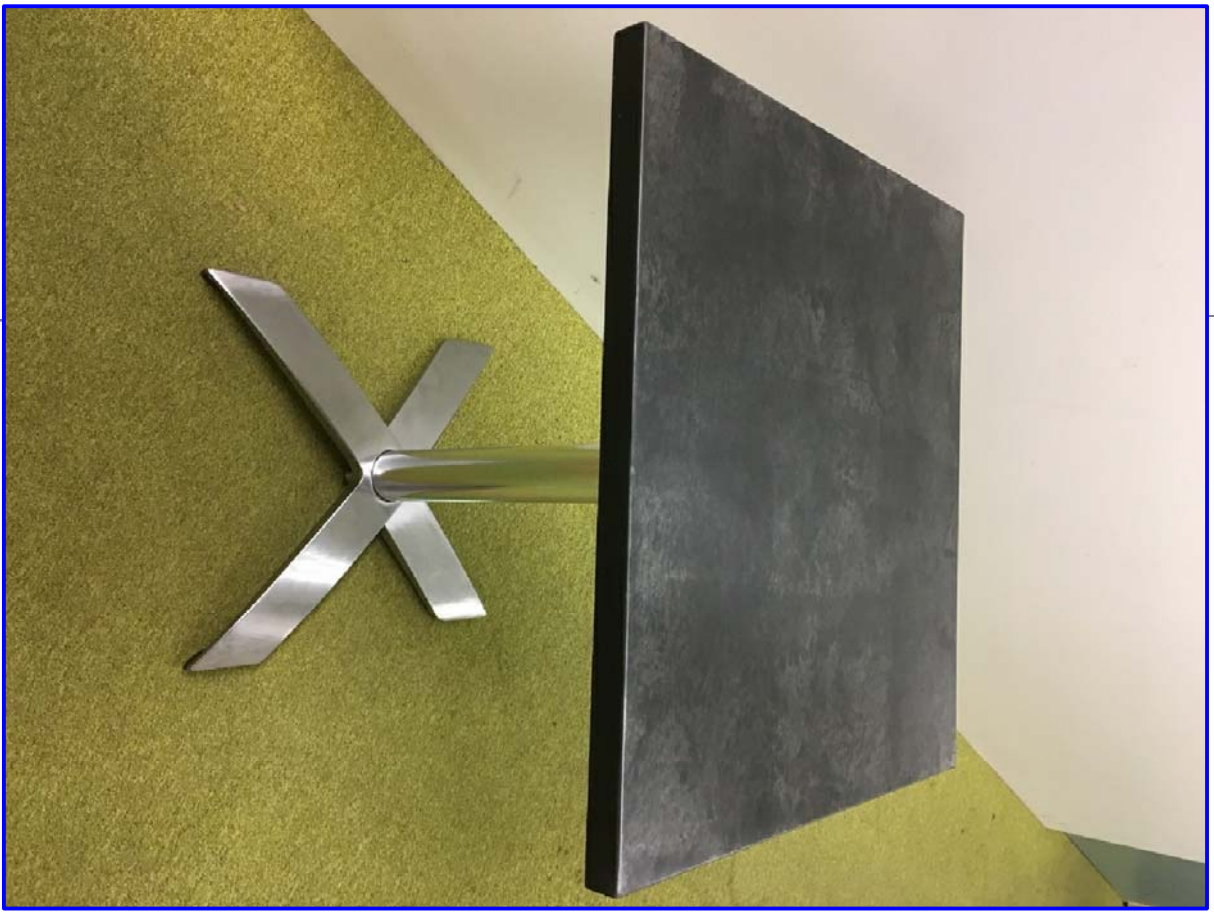
3no. dining table 650x600xH750 mm

NOTES All dimensions must be checked on site and not scaled from this drawing. This drawing is the property of Sit Art Consultancy Ltd and they reserve the copyright. It is issued on the understanding that it will not be copied, reproduced or disclosed in whole or part to any unauthorised party without the written permission of Sit Art Consultancy Ltd.