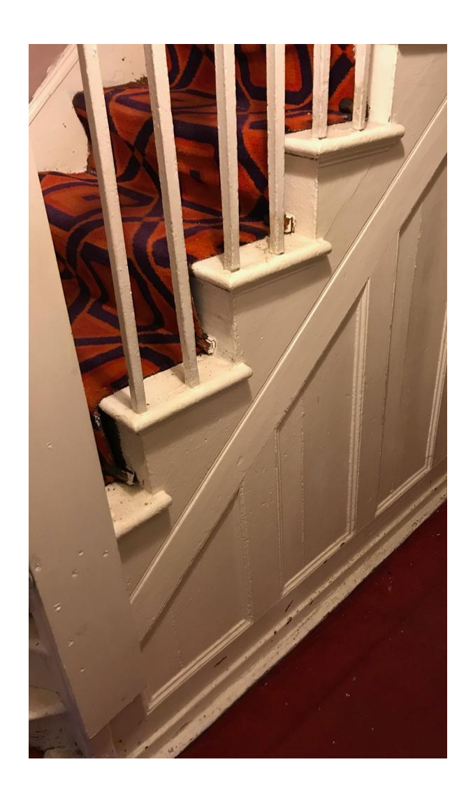
Detail of panelling