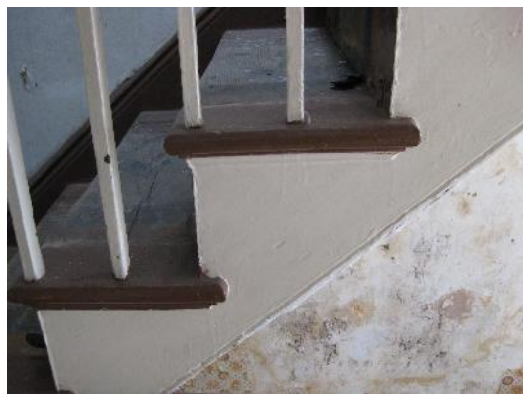
Detail of open string and stick balusters