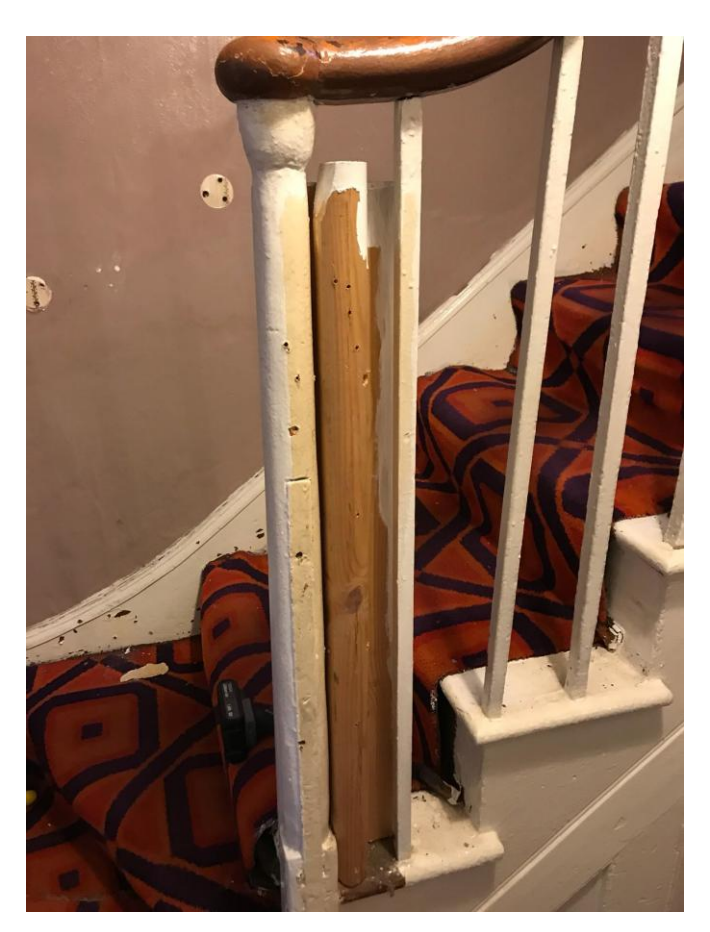
Newel post ground floor