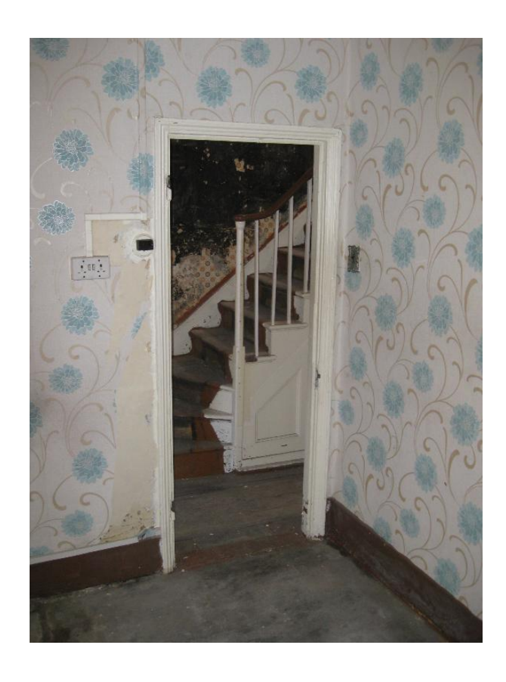
Base of stair and panelled side