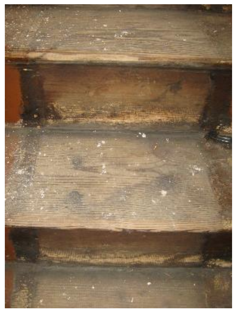
Detail of stair treads