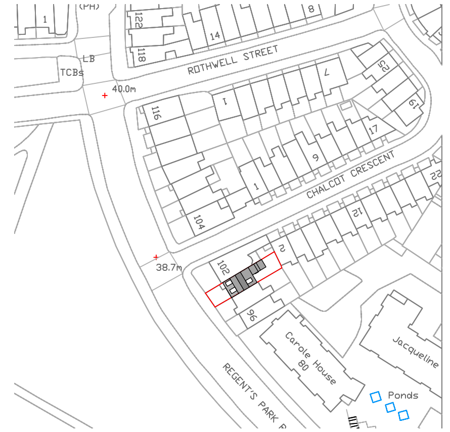
1:1250 Site Location Plan