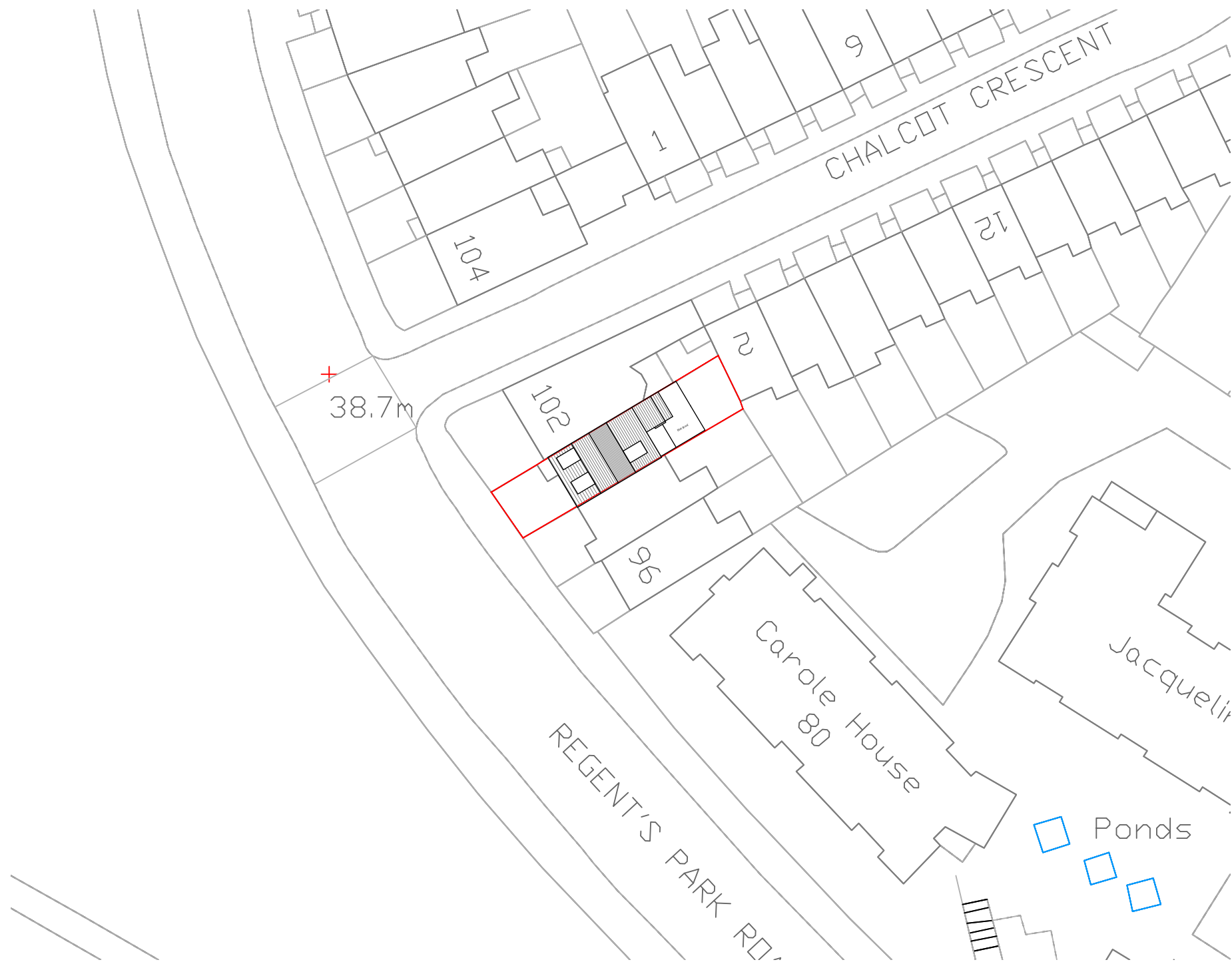
1:500 Site Location Plan