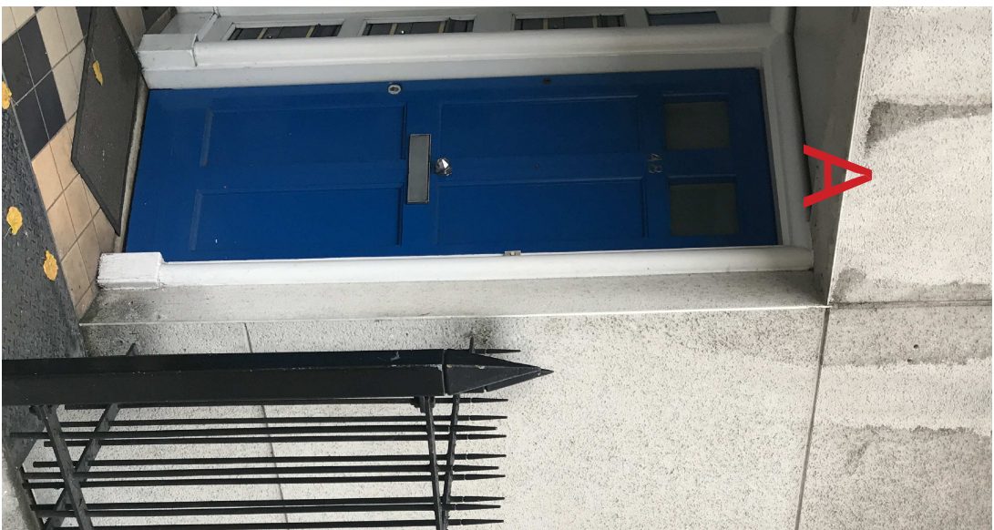
Existing Front Door