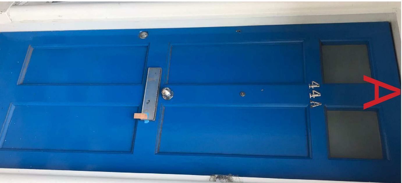
Existing Rear Door