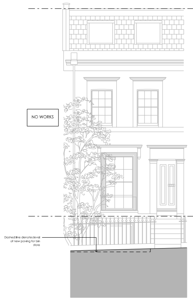
Proposed Front Street Elevation