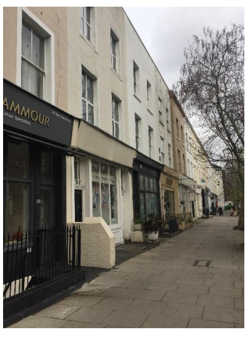
The terrace on Boundary Road.

Photos of the terrace and 126 Boundary Road