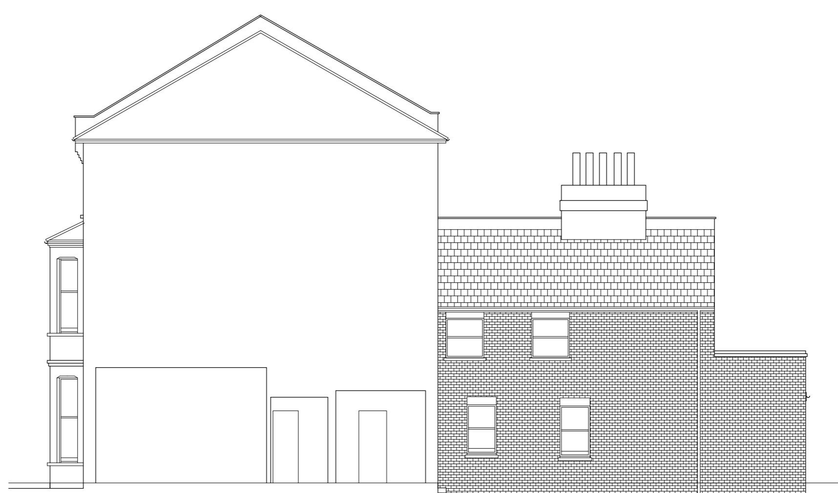
EXISTING SECTION A-A