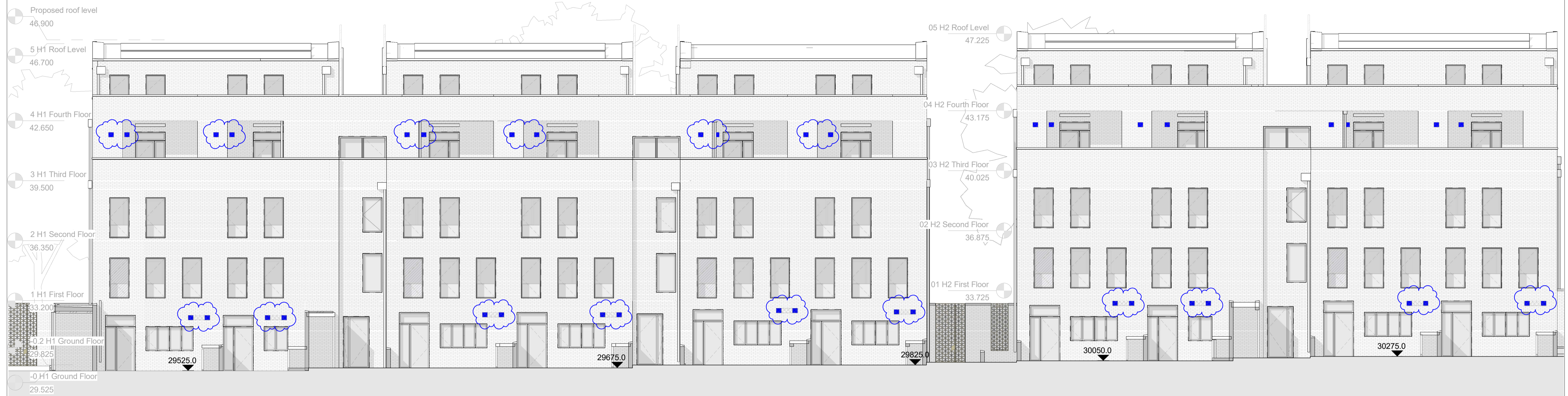
1 South Elevation 1 : 100

This drawing is © Archtype Ltd. Check this drawing is the latest revision. Do not scale from this drawing. Do not use the information on this drawing without checking all dimensions on site. Do not use any areas indicated for either valuation, purchase, sale or any other form of legally binding contract. Do not reproduce any part of this drawing without prior written consent. Report any discrepancies on this document to Archtype. Read this drawing in conjunction with the associated models, specifications and related consultant's documents. Equivalent products / materials may be Approved where the Employer's Requirements, Thermal Performance, Airtightness and any other specified performance requirements are met. Subject to Archtype "Acceptance". All materials to be certified to comply with BS 14001 or BES6001 or be able to provide a Chain of Custody certificate in order to comply Code for Sustainable Homes. All timber species and sources used in this development are not to be listed on the CITES appendices for endangered or threatened species (appendix I, II or III)