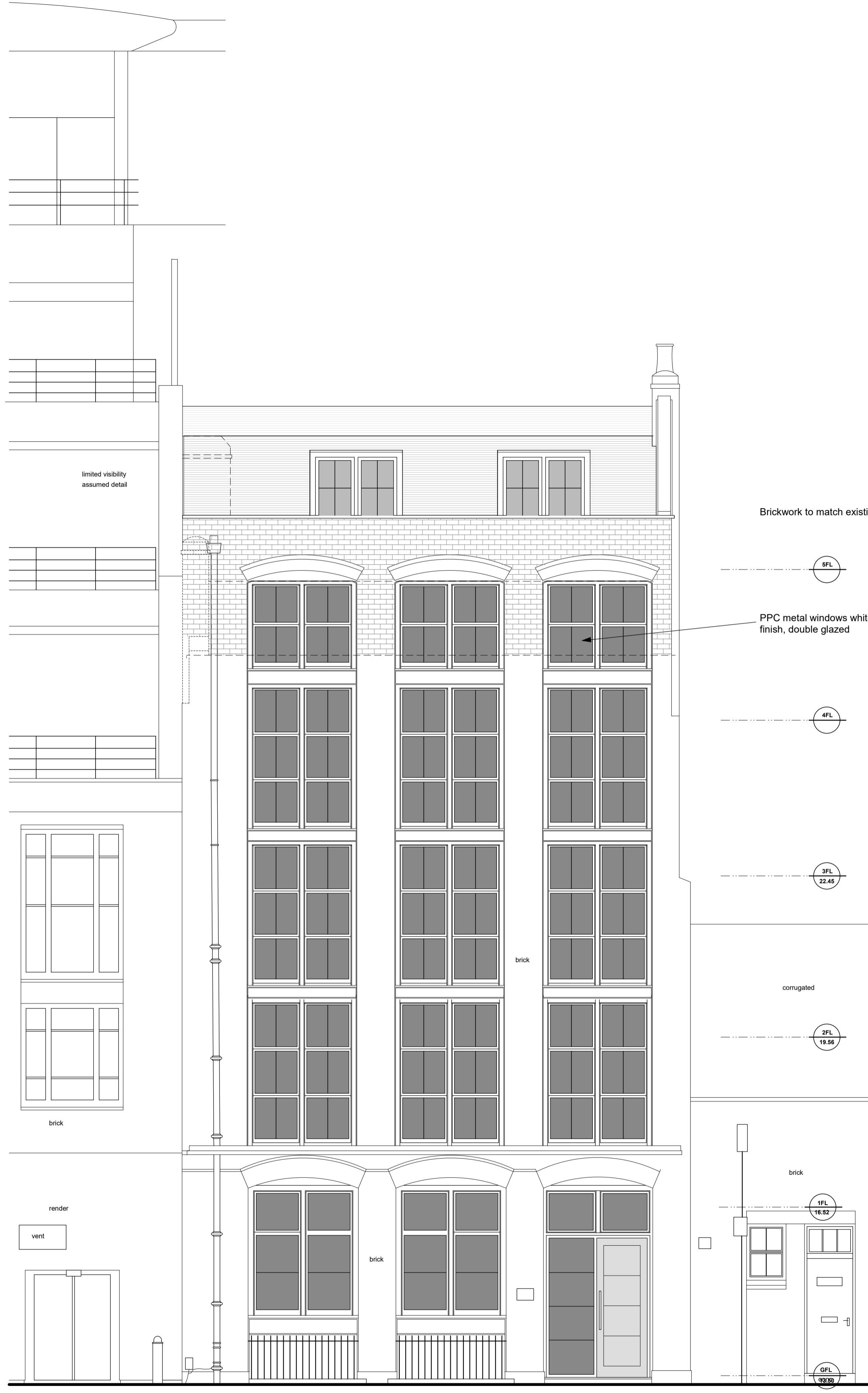
NORTH EAST ELEVATION (SAFFRON HILL) (A.O.D 12.00m)