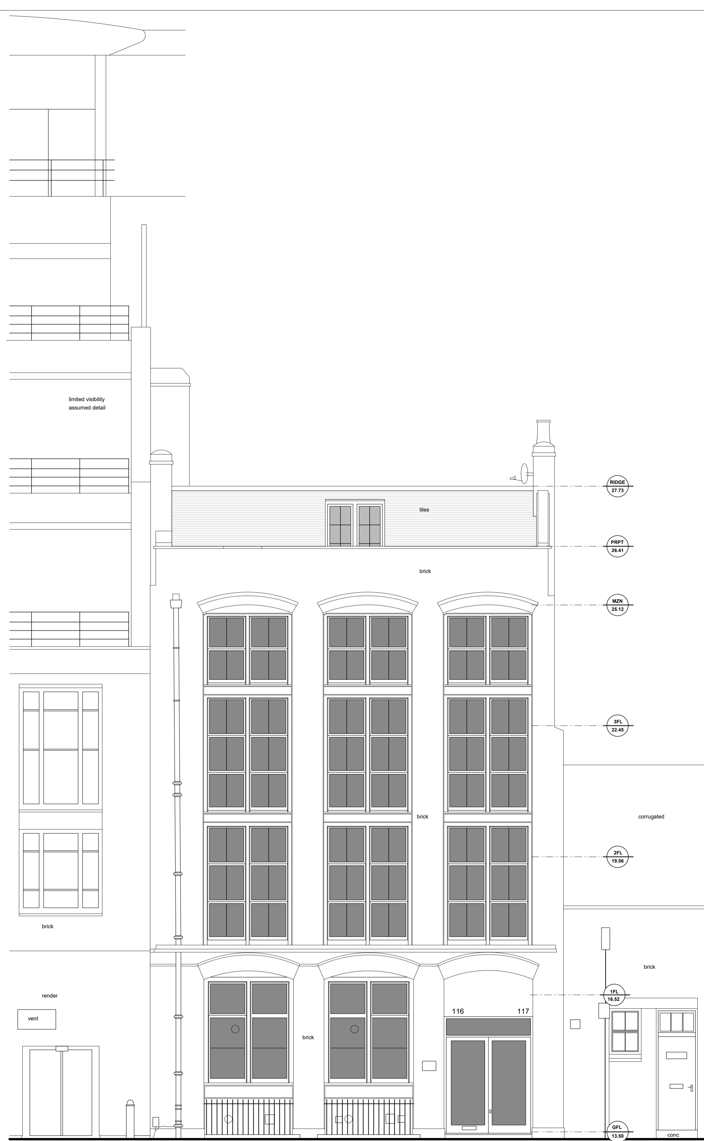
NORTH EAST ELEVATION (SAFFRON HILL) (A.O.D 12.00m)

Walls; Yellow stock brickwork & chimney stacks. Concrete copings Roofs; Natural slate tiles, (assumed) lead crown roof. Asphalt flat roofs. Leadwork to dormers. Timber fascia/soffit. Windows; Painted timber casements, aluminium glazed entrance doors Rainwater Goods & Foul Pipework; Black cast iron type & upvc downpipes and guttering