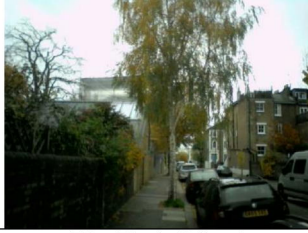
T6 - Birch (Silver)