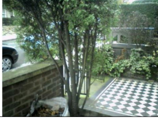
T4 - Pittosporum