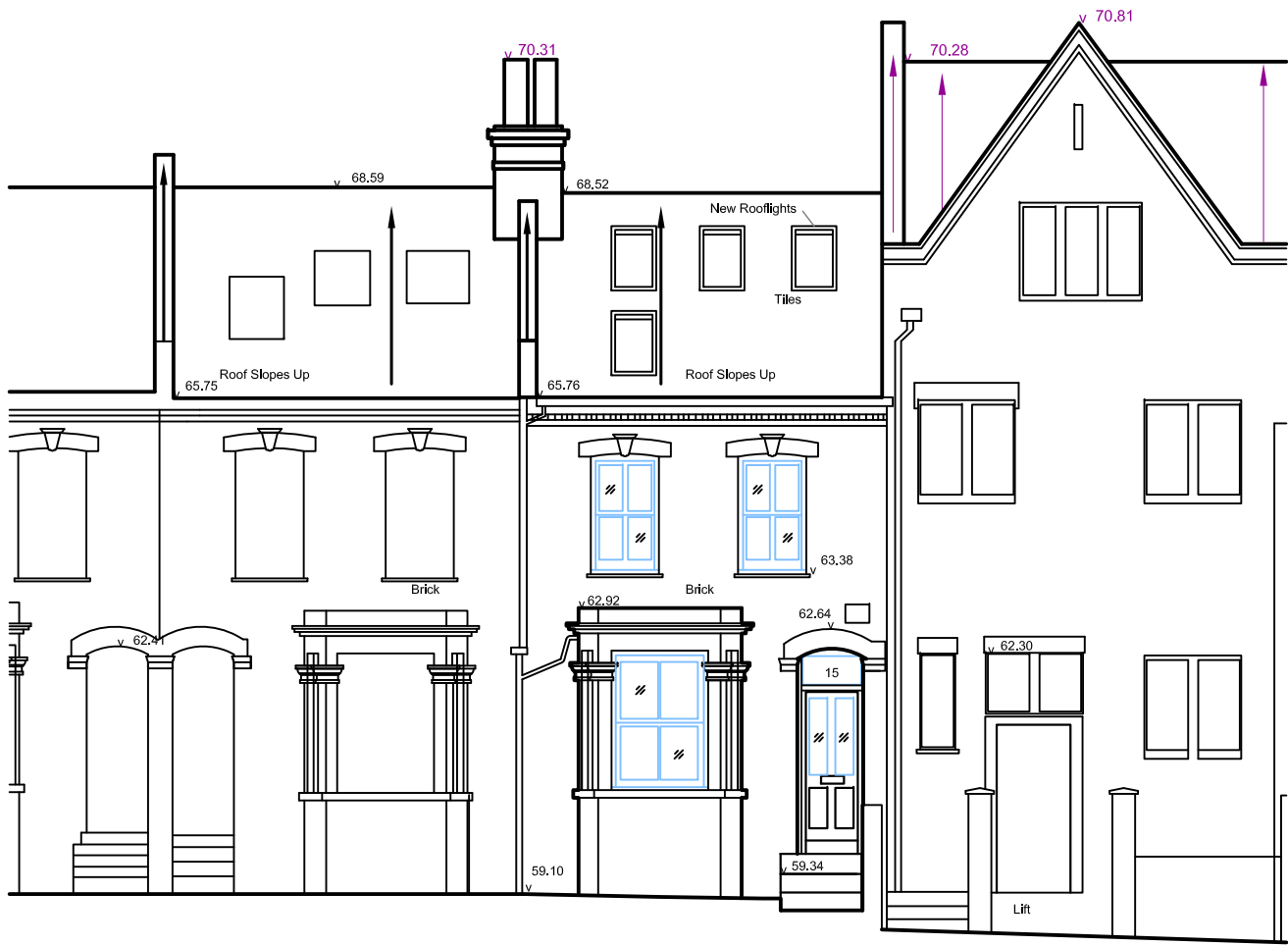
01. Dornfell Street Elevation (South Elevation)