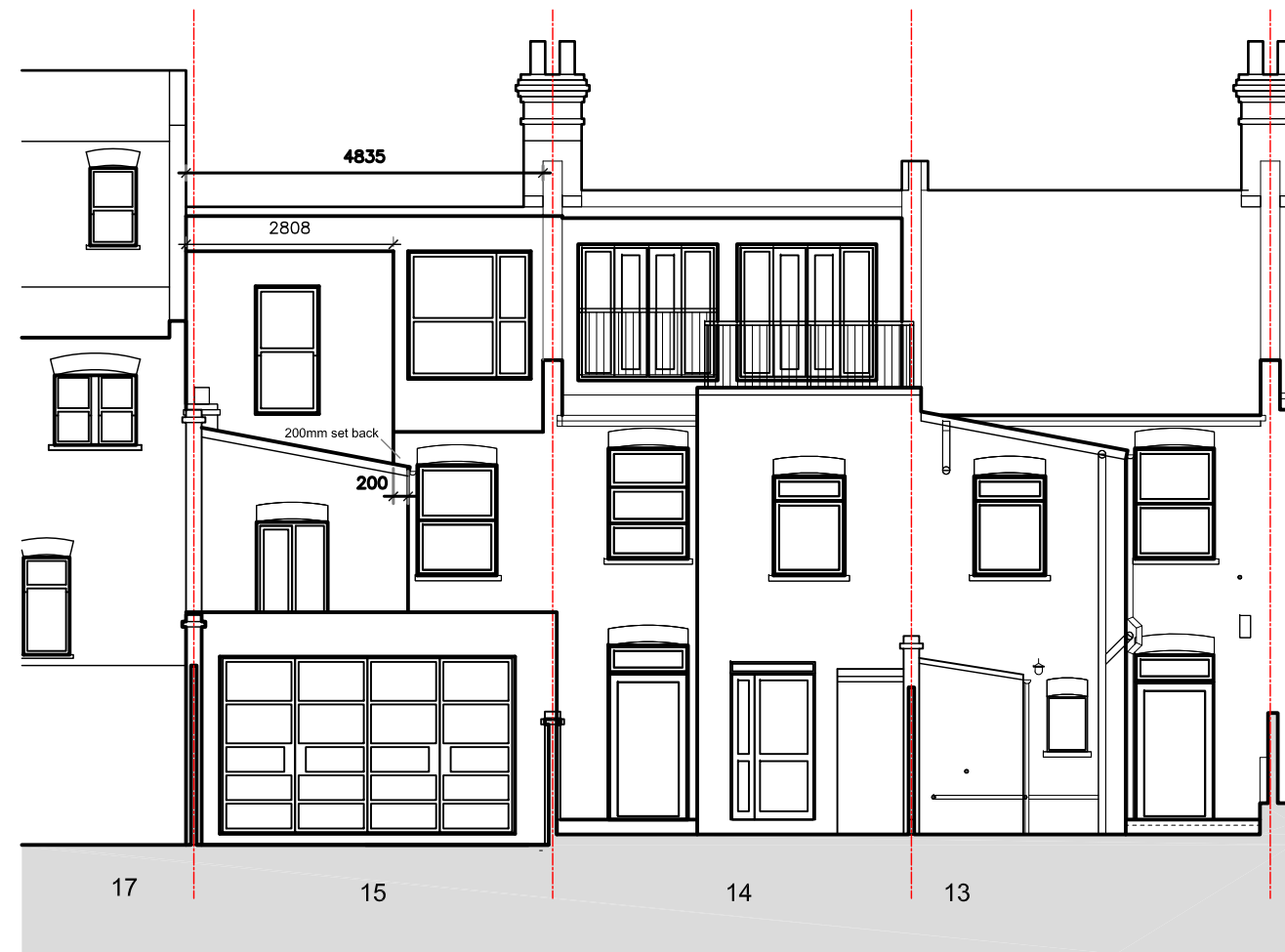
02. Back Garden Elevation (North Elevation)