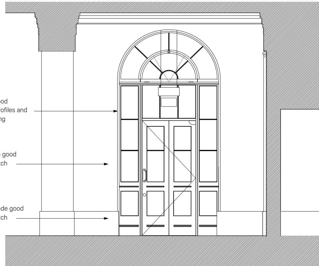
Internal Elevation as Proposed 1:25 @ A1

Exterior grade hardwood door and sidelights. Profiles and glazing to match exiting