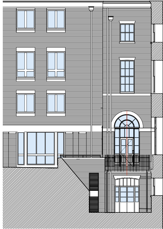
Sectionl Elevation A 1:100 @ A1