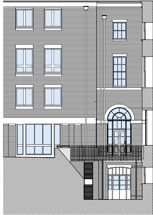
Sectionl Elevation B 1:100 @ A1