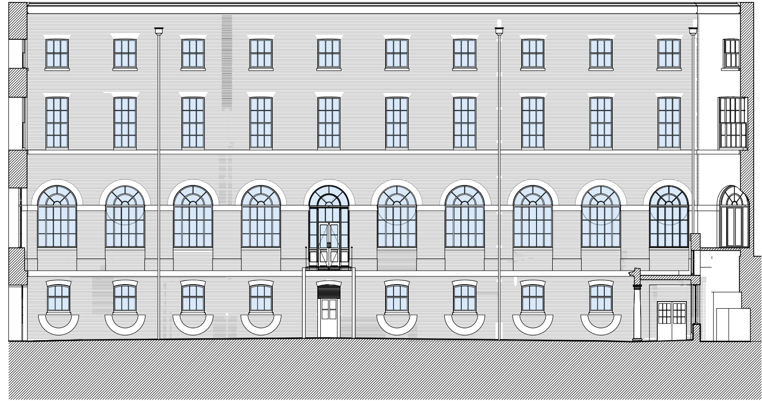
Section I Elevation B 1:100 @ A1