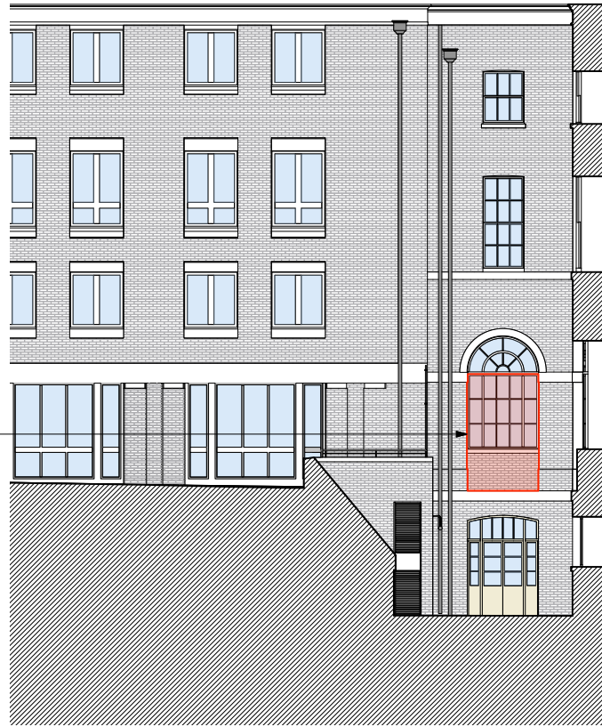
Section I Elevation A 1:100 @ A1

Area to be demolished to create new access