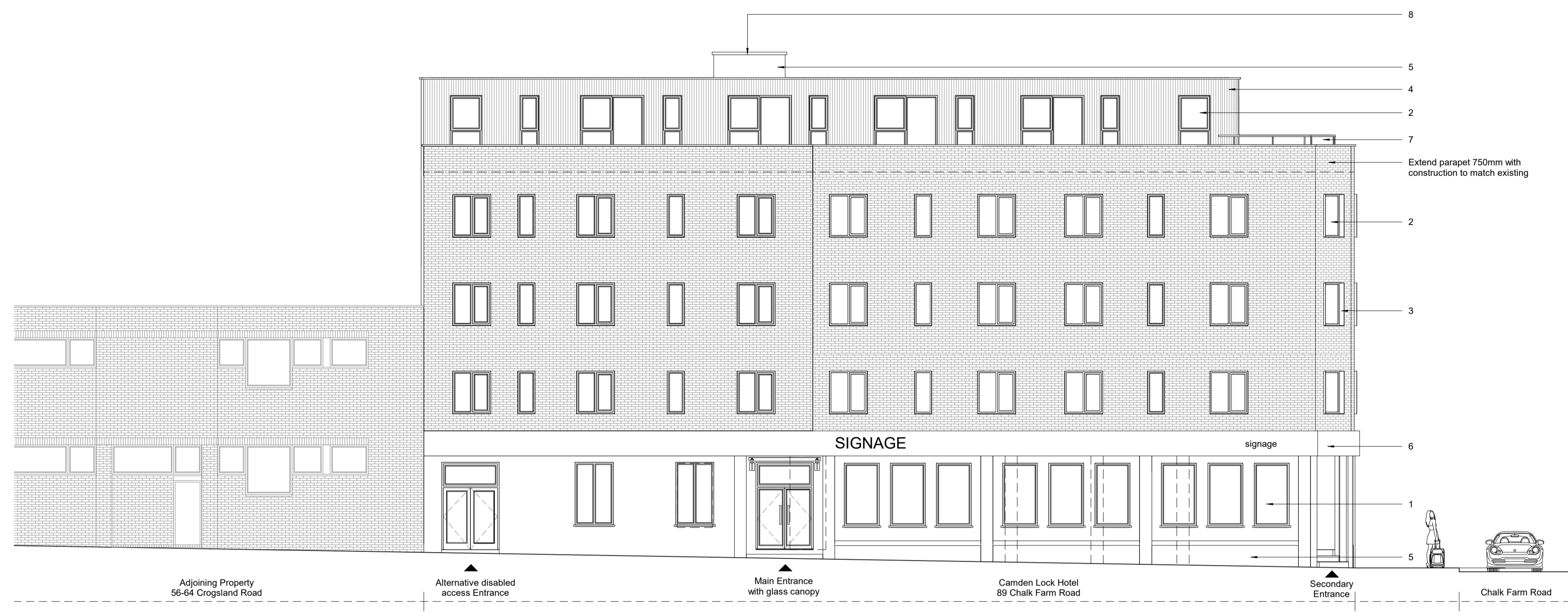
Crogsland Road Elevation as Proposed (1-1) 1 : 100