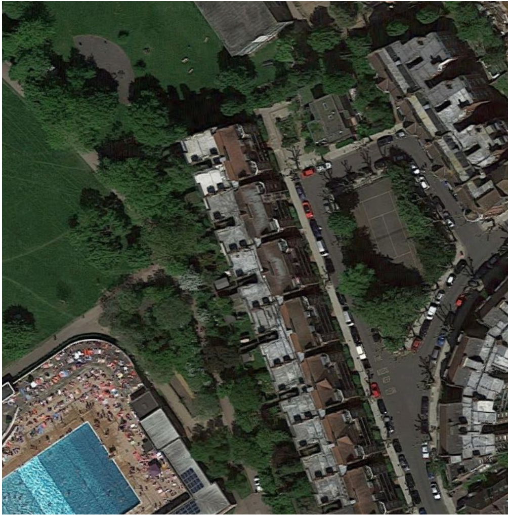
002 Aerial Site Photograph NTS