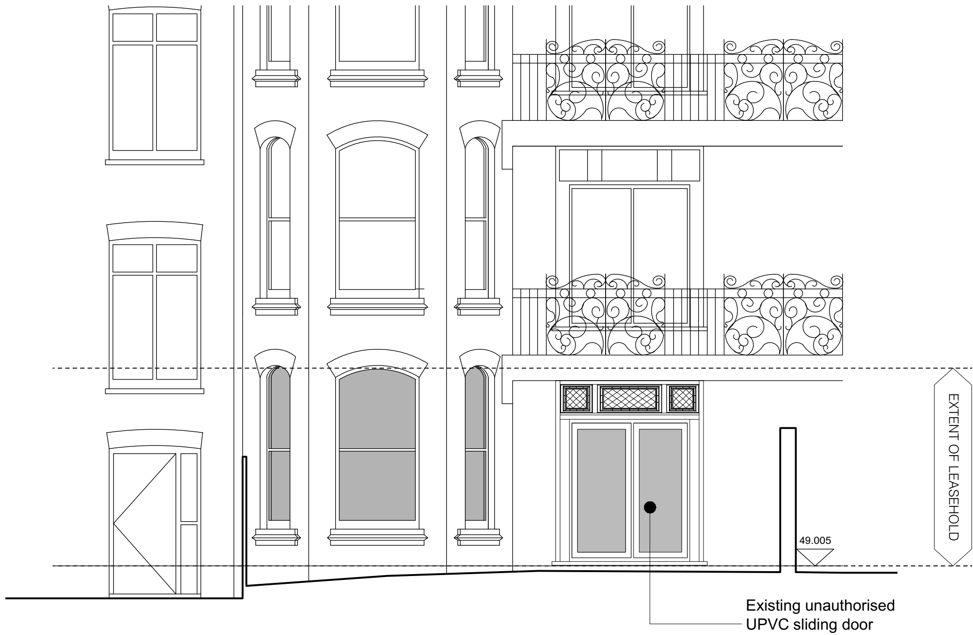
3 EXISTING REAR ELEVATION Scale: 1:50