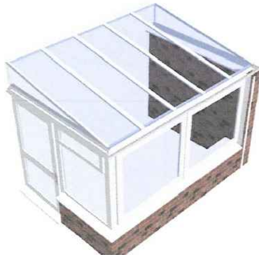
ISO METRIC VIEW OF PROPOSED CONSERVATORY EXTENSION