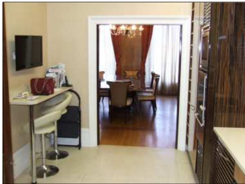
Kitchen to be refitted with modern worktops and kitchen units (similar to the kitchen fit out at 33 Chester Terrace)

Note All existing windows, skirting boards and staircase handrails to be retained and painted if necessary. All the cornices in the building to be replaced and installed ditto to the cornices installed at 33 Chester Terrace.