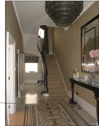
Entrance Hall to incorporate similar design features, such as floor tiles and stair lights as already existing in 33 Chester Terrace