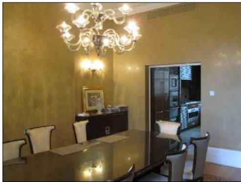
Proposed opening with sliding doors to be as approved / existing at 33 Chester Terrace