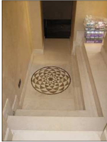
Steps added to a lowered level providing headroom into vaults as approved / existing in 21 Chester Terrace

Note All existing windows, skirting boards and staircase handrails to be retained and painted if necessary. All the cornices in the building to be replaced and installed ditto to the cornices installed at 33 Chester Terrace.