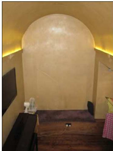
Vault floor level lowered to create usable space within vaults as approved / existing at 33 and 21 Chester Terrace