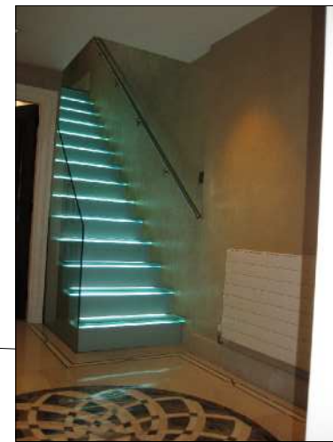
Glass wall to be designed similar to that approved / existing at 21 Chester Terrace (landing to be included in stair design as shown in plan)