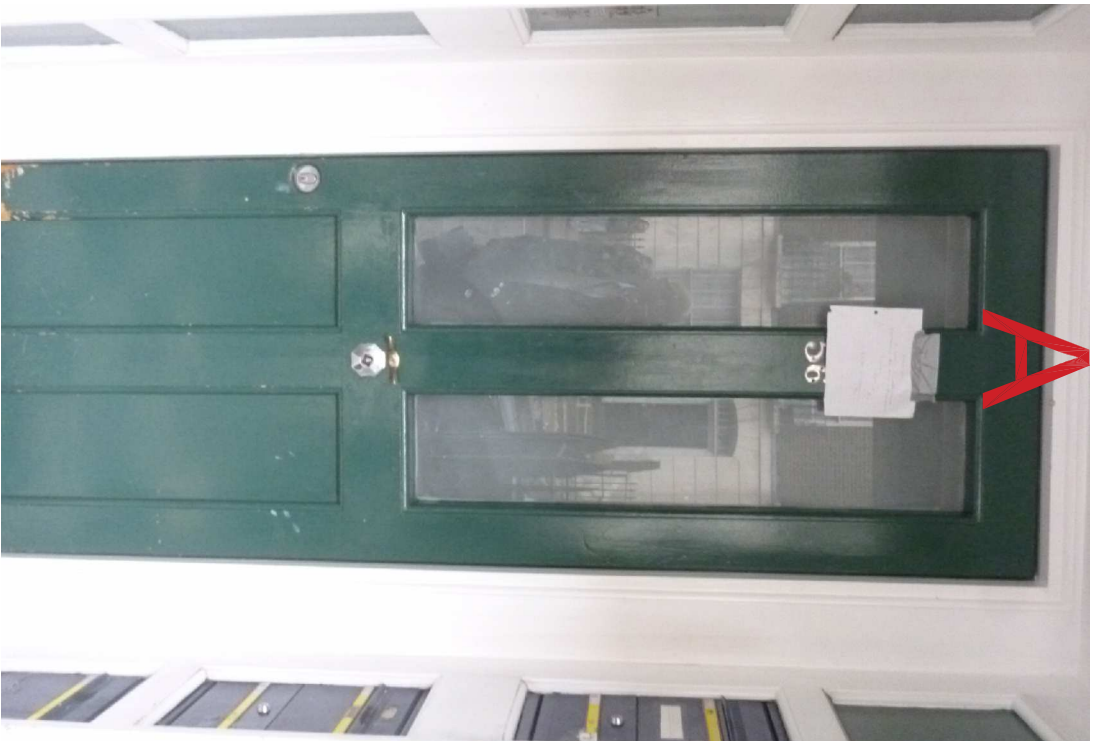
Existing Rear Door