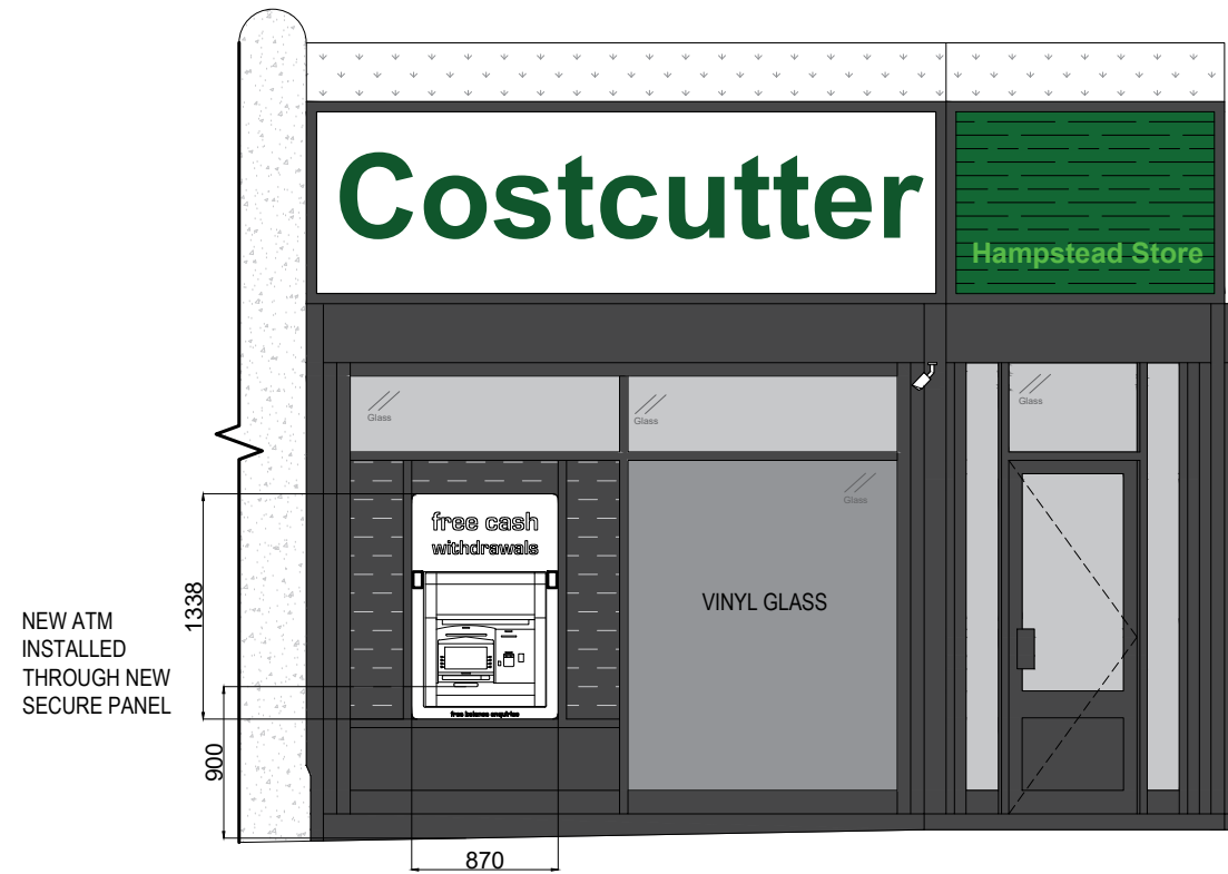
AS-INSTALLED FRONT ELEVATION