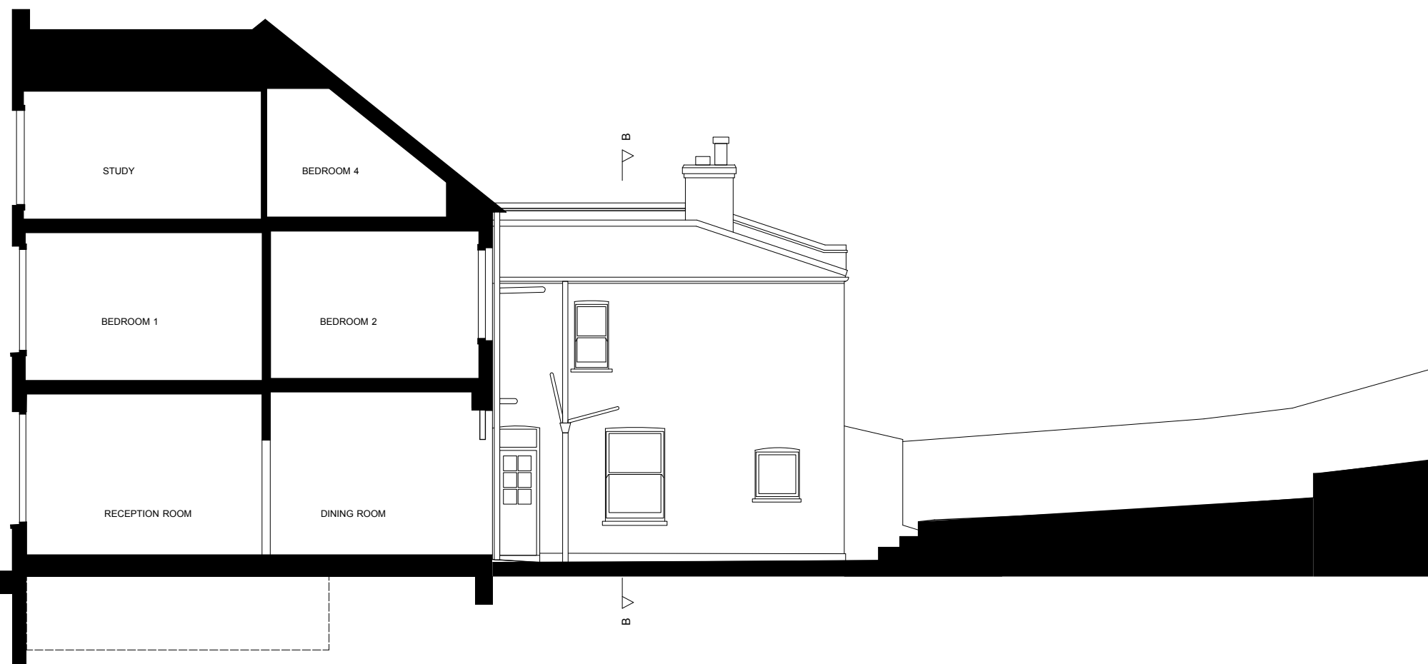
1 existing long section A