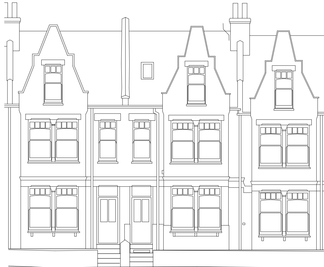
1 existing front elevation