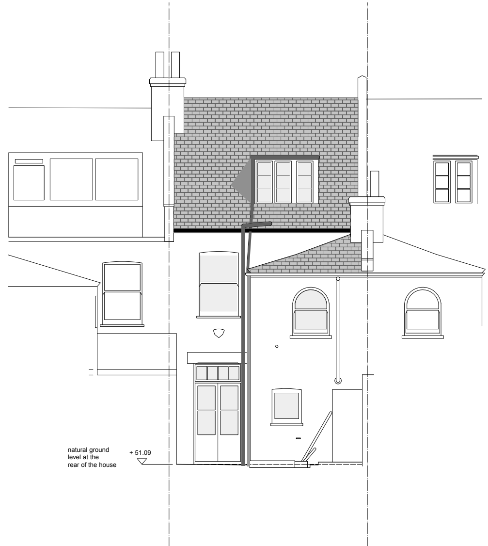
2 existing rear elevation

natural ground level at the rear of the house + 51.09