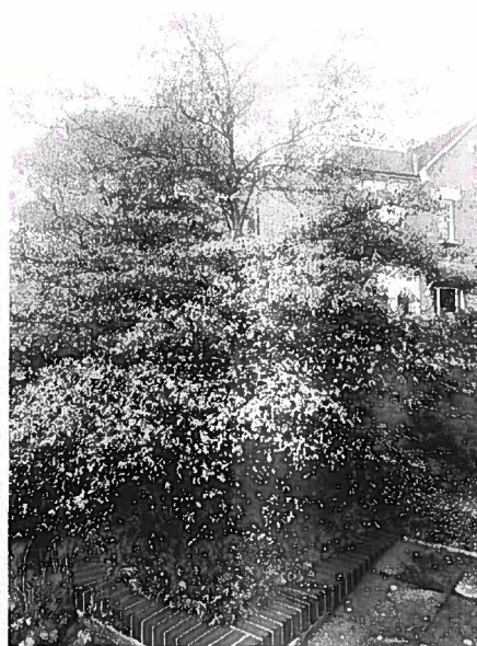
T3 - Cornus, to be removed