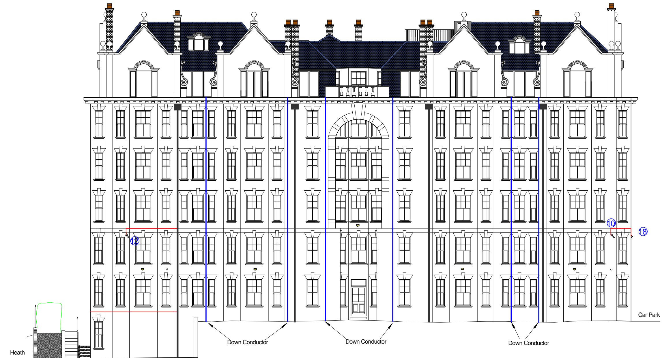
North Elevation Proposed