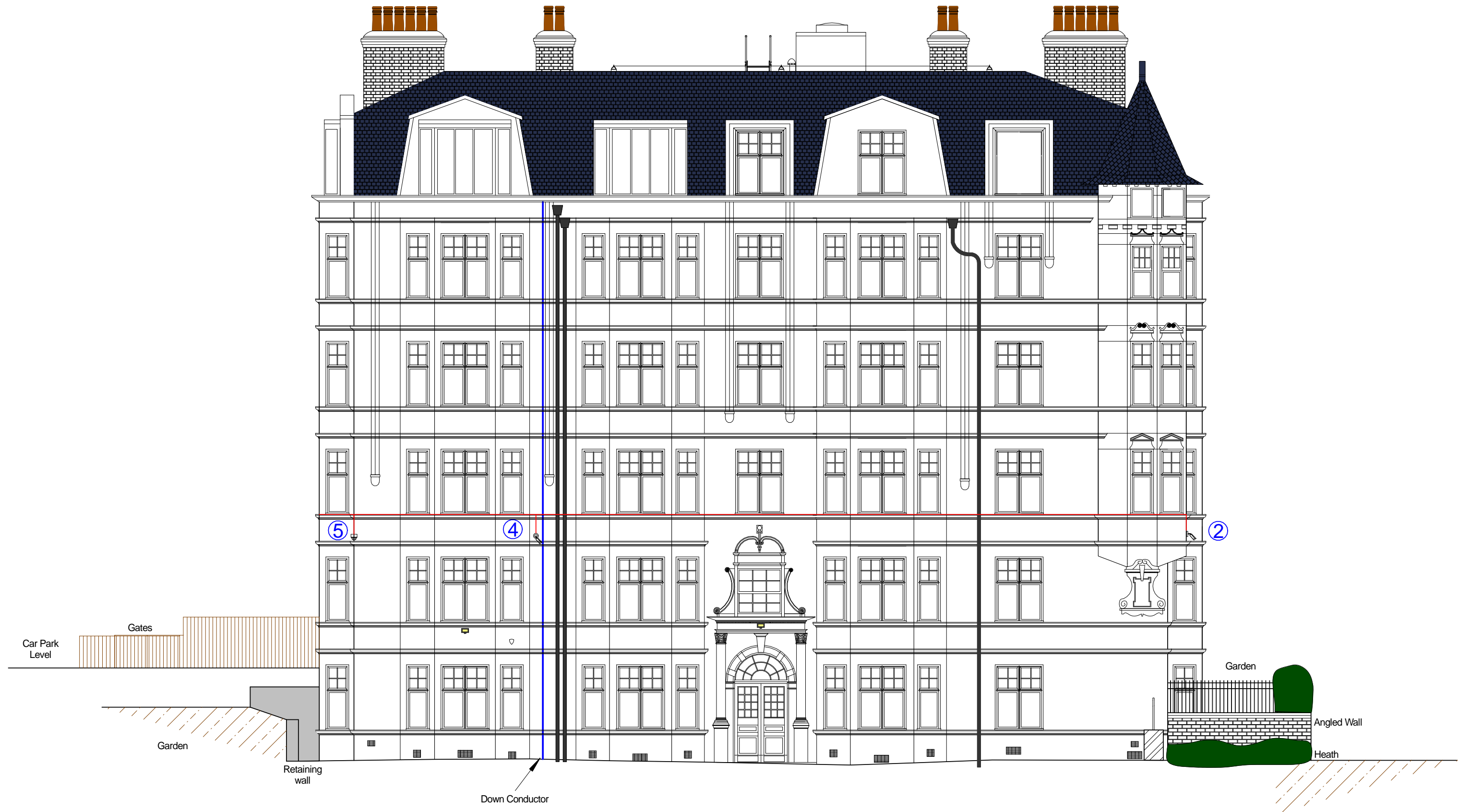
North Elevation Proposed