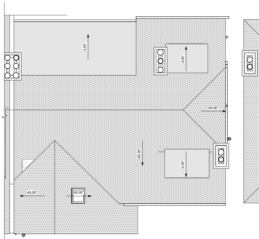
4 Existing Roof Plan 1 : 50