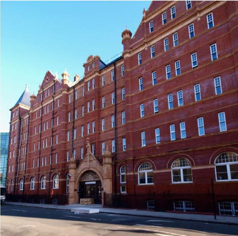
IoE Number: 505028 Location: ARLINGTON HOUSE (FORMER CAMDEN TOWN ROWTON HOUSE), ARLINGTON ROAD, CAMDEN TOWN, CAMDEN, GREATER LONDON Date photographed: 2012 Date listed: 24-Jan-2011 Grade II

II Men's Lodging House, opened in 1905, refurbished 1983-88 and 2008-10. Designed by Harry Bell Measures FRIBA. Refurbished 1983-8 and 2009-10 by Levitt Bernstein Architects.