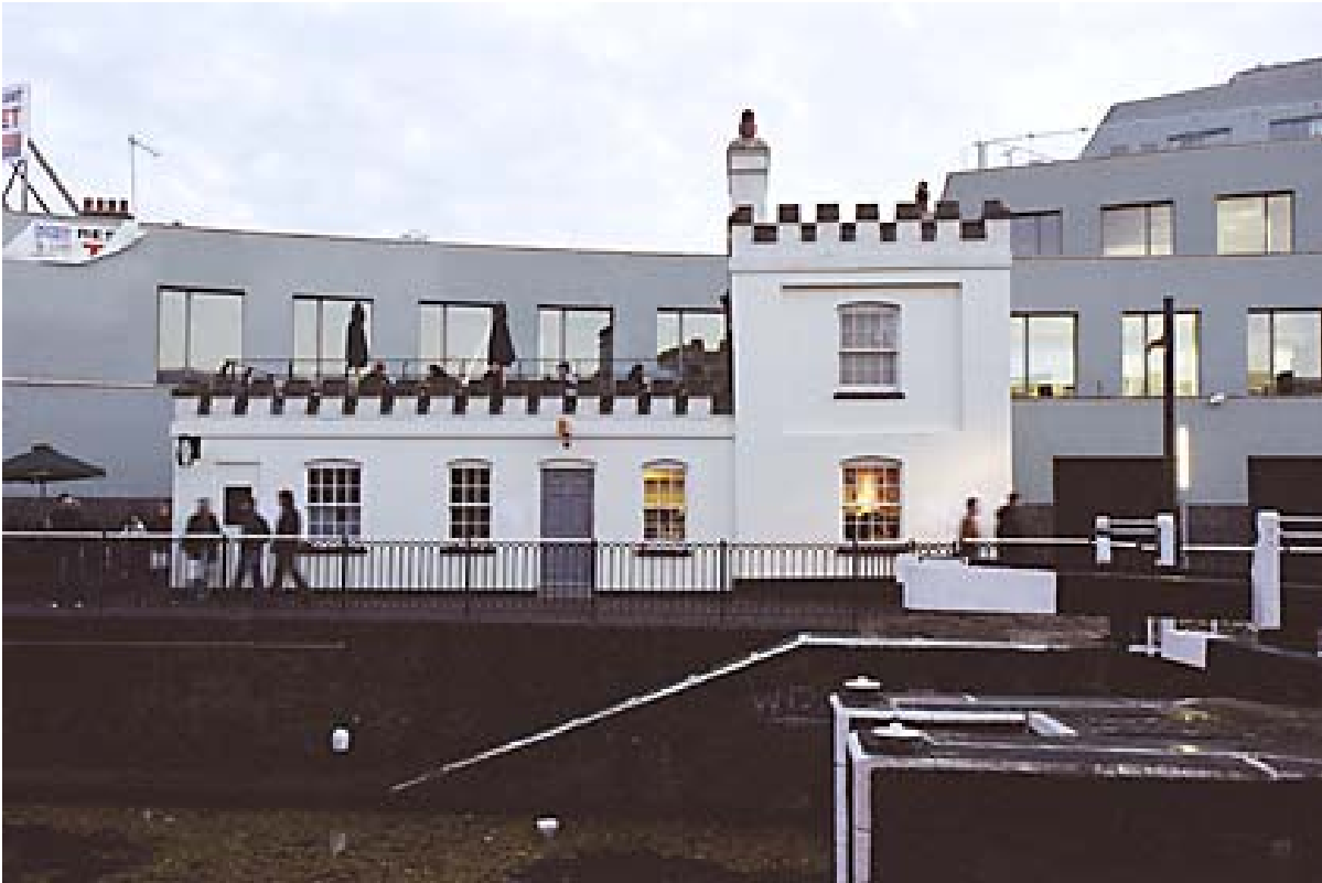
IoE Number: 476803 Location: REGENTS CANAL INFORMATION CENTRE, 289 CAMDEN HIGH STREET (west side), CAMDEN TOWN, CAMDEN, GREATER LONDON Date Photographed: 04 December 2005 Date listed: 14 May 1974 Date of last amendment: 11 January 1999 Grade II

CAMDEN TQ2884SE CAMDEN HIGH STREET 798-1/65/151 Hampstead Road Bridge over Grand Union Canal GV II Public road bridge over the Grand Union Canal and towpaths. 1876, replacing an earlier inadequate brick bridge of c1815. Provided by the St Pancras Vestry and the Metropolitan Board of Works. Slightly cambered cast-iron girder bridge. Cast-iron panelled parapets with relief moulded rectangles; similar parapets on bridge deck provide pedestrian walkways. Brick abutments with stone coping. Stone plaque in north-east abutment recording the rebuilding.