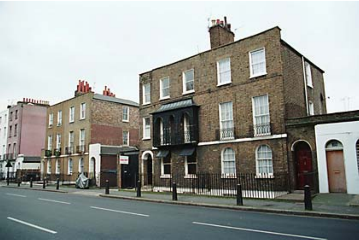
IoE Number: 476827 Location: NUMBERS 162-168 AND ATTACHED RAILINGS, 162-168 CAMDEN STREET (east side), CAMDEN TOWN, CAMDEN, GREATER LONDON Date Photographed: 29 January 2007 Date listed: 14 May 1974 Date of last amendment: 14 May 1974 Grade II

CAMDEN TQ2884SE CAMDEN STREET 798-1/65/161 (East side) 14/05/74 Nos.162-168 (Even) and attached railings GV II Pair of semi-detached houses. Early C19. Yellow stock brick. 3 storeys and basements. 2 windows each. Round-arched ground floor openings. Nos 162, 166 & 168 with rusticated stucco side porticoes. Fanlights and panelled doors. No.164 with cast-iron hoods to windows and originally to entrance. Plain stucco bands at 1st floor level. Gauged brick flat arches to recessed sashes; 1st floor with cast-iron balconies. No.164, 1st floor with rare survival of wooden verandah having 3 round arches, intricate fretwork detail, trellis ends and metal hood. Parapets. INTERIORS: not inspected. SUBSIDIARY FEATURES: attached cast-iron railings with urn finials to areas. (Survey of London : Vol. XIX, Old St Pancras and Kentish Town: London: - 1938: 50).