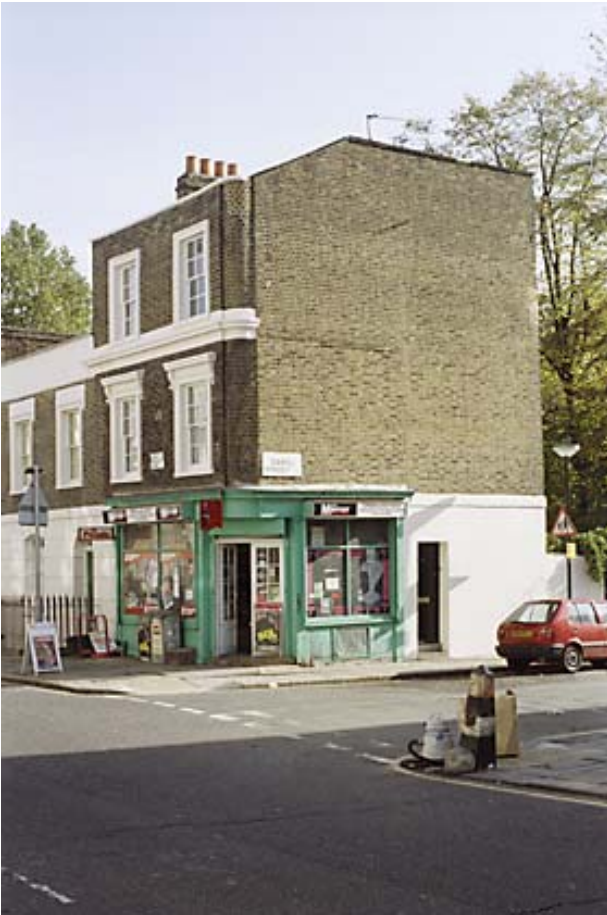
IoE Number: 477894 Location: 14 GREENLAND ROAD (south side) CAMDEN TOWN, CAMDEN, GREATER LONDON Date Photographed: 30 October 2004 Date listed: 14 May 1974 Date of last amendment: 14 May 1974 Grade II

CAMDEN TQ2983NW GREENLAND ROAD 798-1/77/703 (South side) 14/05/74 No.14 GV II End of terrace house. Early C19. Yellow stock brick and stucco ground floor with plain stucco 1st floor band. Corner site with angle bowed. 3 storeys and cellar. 2 windows. Wooden double shopfront with entrance on corner having C20 part-glazed double doors. Slightly projecting shop windows with C20 glazing; boxed out entablature with projecting cornice, broken back at corner. Plain, square-headed house entrance to right of shop window on Carol Street return. Recessed, architraved sashes; 1st floor with console bracketed cornices. Stucco cornice at 2nd floor level. Parapet. INTERIOR: not inspected.