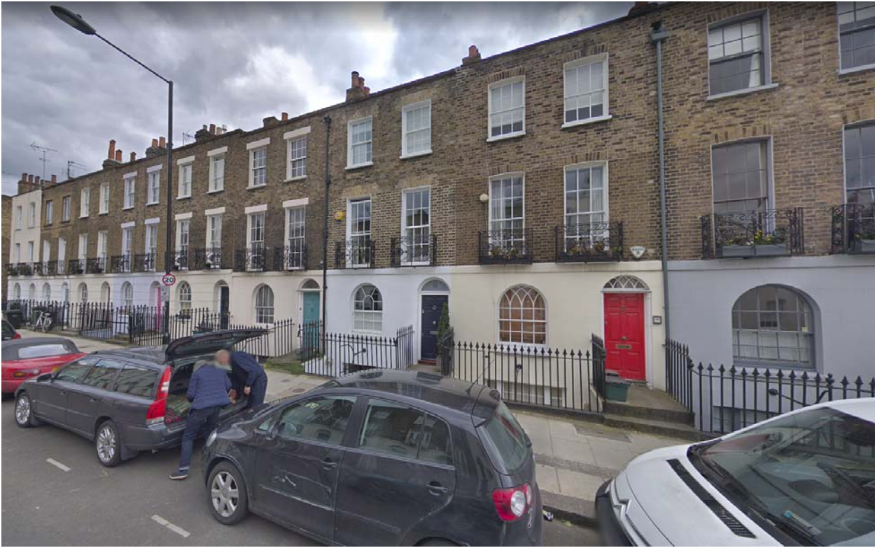
IoE Number: 478519 Location: NUMBERS 162-168 AND ATTACHED RAILINGS, 162-168 CAMDEN STREET (east side), CAMDEN TOWN, CAMDEN, GREATER LONDON Date listed: 14-May-1974 Grade II

CAMDEN TQ2884SE CAMDEN STREET 798-1/65/161 (East side) 14/05/74 Nos.162-168 (Even) and attached railings GV II Pair of semi-detached houses. Early C19. Yellow stock brick. 3 storeys and basements. 2 windows each. Round-arched ground floor openings. Nos 162, 166 & 168 with rusticated stucco side porticoes. Fanlights and panelled doors. No.164 with cast-iron hoods to windows and originally to entrance. Plain stucco bands at 1st floor level. Gauged brick flat arches to recessed sashes; 1st floor with cast-iron balconies. No.164, 1st floor with rare survival of wooden verandah having 3 round arches, intricate fretwork detail, trellis ends and metal hood. Parapets. INTERIORS: not inspected. SUBSIDIARY FEATURES: attached cast-iron railings with urn finials to areas. (Survey of London : Vol. XIX, Old St Pancras and Kentish Town: London: - 1938: 50).