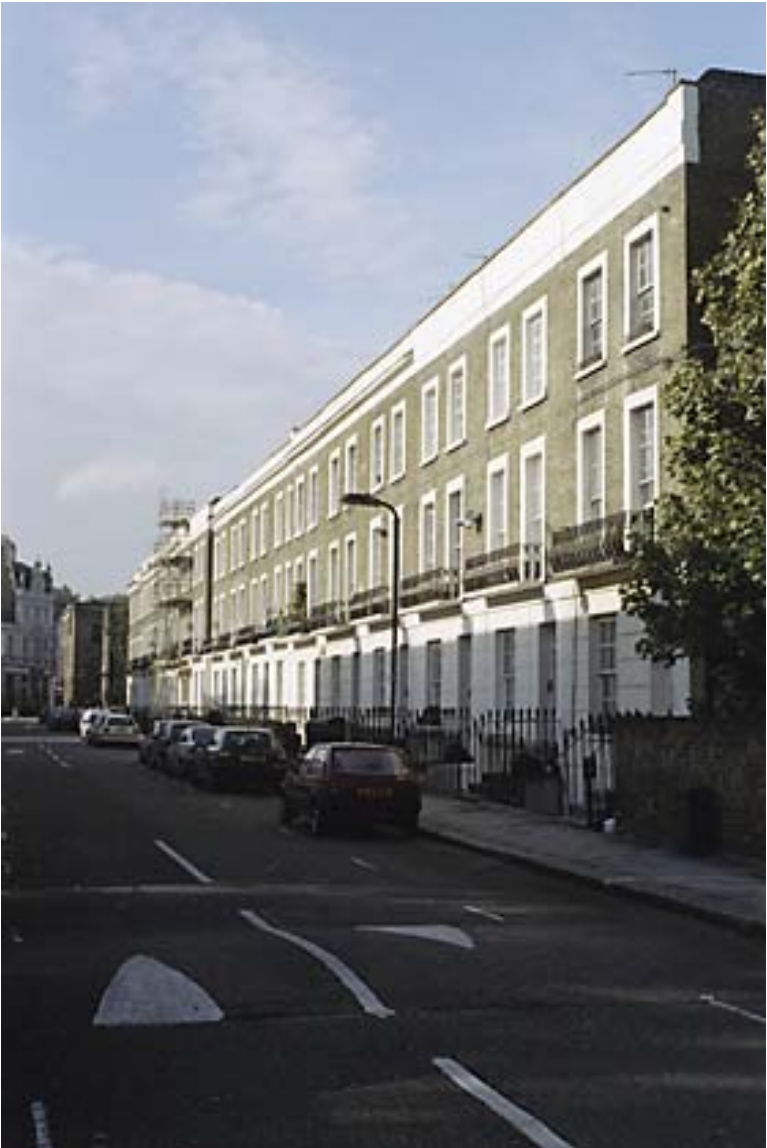
IoE Number: 477891 Location: NUMBERS 7 TO 41 AND ATTACHED RAILINGS, 7-41 GREENLAND ROAD (north side), CAMDEN TOWN, CAMDEN, GREATER LONDON Date Photographed: 30 October 2004 Date listed: 14 April 1974 Date of last amendment: 14 April 1974 Grade II

CAMDEN TQ2983NW GREENLAND ROAD 798-1/77/701 (North side) 14/05/74 Nos.7-41 (Odd) and attached railings GV II Terrace of 18 houses. Mid C19, restored c1976 as a GLC renovation scheme. Yellow stock brick with rusticated stucco ground floor and plain stucco 1st floor band. Nos 11-21 and 31-43 slightly projecting. 3 storeys and basements. 2 windows each. Square-headed, recessed doorways with pilaster-jambs carrying cornice-heads; fanlights and panelled doors. Recessed sashes; ground floor of No.7 with good cast-iron window guard, upper floors architraved: Nos 7 & 9 with cornices to 1st floor. Cast-iron balconies to 1st floor windows. Stucco cornice and blocking course except Nos 9, 19 & 21 and 37-41 where the cornices have been cut back. INTERIORS: not inspected. SUBSIDIARY FEATURES: attached cast-iron railings with bud finials to areas.