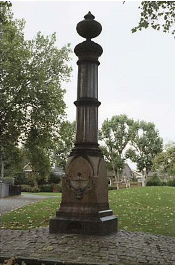
IoE Number: 476832 Location: DRINKING FOUNTAIN IN ST MARTINS GARDENS (RECREATION GROUND), CAMDEN STREET, CAMDEN TOWN, CAMDEN, GREATER LONDON Date Photographed: 09 October 2004 Date listed: 01 July 1998 Date of last amendment: 01 July 1998 Grade II

CAMDEN TQ2983NW CAMDEN STREET 798-1/77/166 Drinking fountain in St Martin's 01/07/98 Gardens (Recreation Ground) GV II Drinking fountain situated inside the gardens opposite the main gate. Late C19. Granite on a cobbled set. Rectangular plinth, with top of angles chamfered, supporting a ringed column surmounted by an urn.