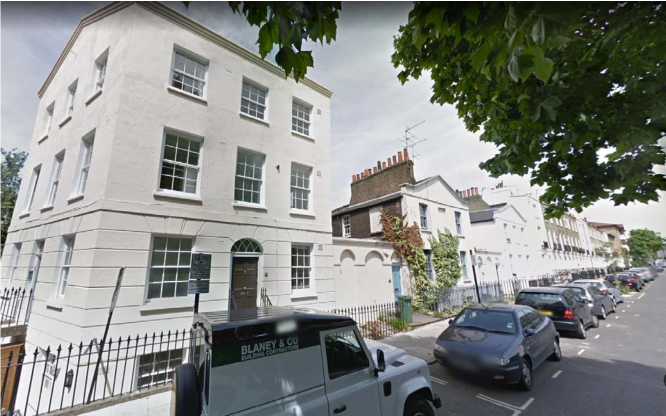
IoE Number: 478518 Location: NUMBERS 3 TO 9 AND ATTACHED RAILINGS, JEFFREY'S STREET, CAMDEN TOWN, CAMDEN, GREATER LONDON Date listed: 14 May 1974 Grade II

2 pairs linked semi-detached houses. Early C19. Stucco fronts with brick returns. Slated pitched roofs with central tall slab chimney-stacks. 2 storeys and basements. 3 windows, central bays blind. Entrances in round-arched side porticoes linked by central blind arch to form arcaded screens. Square-headed doorways with reeded jambs, cornice-heads and panelled doors. Recessed sashes. Gable ends with moulded coping and plain band forming pediments. INTERIORS: not inspected. SUBSIDIARY FEATURES: attached cast-iron railings with urn finials to areas. (Survey of London: Vol. XIX, Old St Pancras and Kentish Town (St Pancras part II): London: -1938: 49)