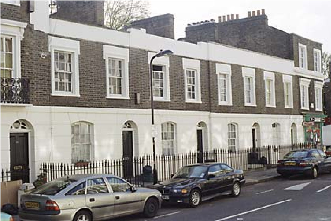
IoE Number: 477897 Location: NUMBERS 16 TO 22 AND ATTACHED RAILINGS, 16-22 GREENLAND ROAD (south side), CAMDEN TOWN, CAMDEN, GREATER LONDON Date Photographed: 30 October 2004 Date listed: 14 May 1974 Date of last amendment: 14 May 1974 Grade II

CAMDEN TQ2983NW GREENLAND ROAD 798-1/77/703 (South side) 14/05/74 No.14 GV II End of terrace house. Early C19. Yellow stock brick and stucco ground floor with plain stucco 1st floor band. Corner site with angle bowed. 3 storeys and cellar. 2 windows. Wooden double shopfront with entrance on corner having C20 part-glazed double doors. Slightly projecting shop windows with C20 glazing; boxed out entablature with projecting cornice, broken back at corner. Plain, square-headed house entrance to right of shop window on Carol Street return. Recessed, architraved sashes; 1st floor with console bracketed cornices. Stucco cornice at 2nd floor level. Parapet. INTERIOR: not inspected.