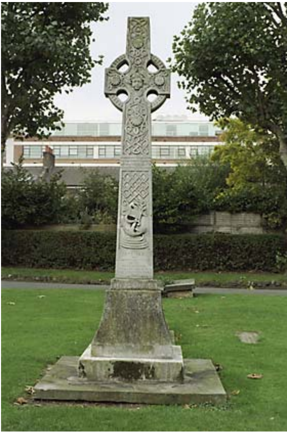
IoE Number: 476830 Location: CHARLES DIBDIN MEMORIAL IN ST MARTINS GARDENS (RECREATION GROUND), CAMDEN STREET, CAMDEN TOWN, CAMDEN, GREATER LONDON Date Photographed: 09 October 2004 Date listed: 11 January 1999 Date of last amendment: 11 January 1999 Grade II

CAMDEN TQ2983NW CAMDEN STREET 798-1/77/166 Drinking fountain in St Martin's 01/07/98 Gardens (Recreation Ground) GV II Drinking fountain situated inside the gardens opposite the main gate. Late C19. Granite on a cobbled set. Rectangular plinth, with top of angles chamfered, supporting a ringed column surmounted by an urn.