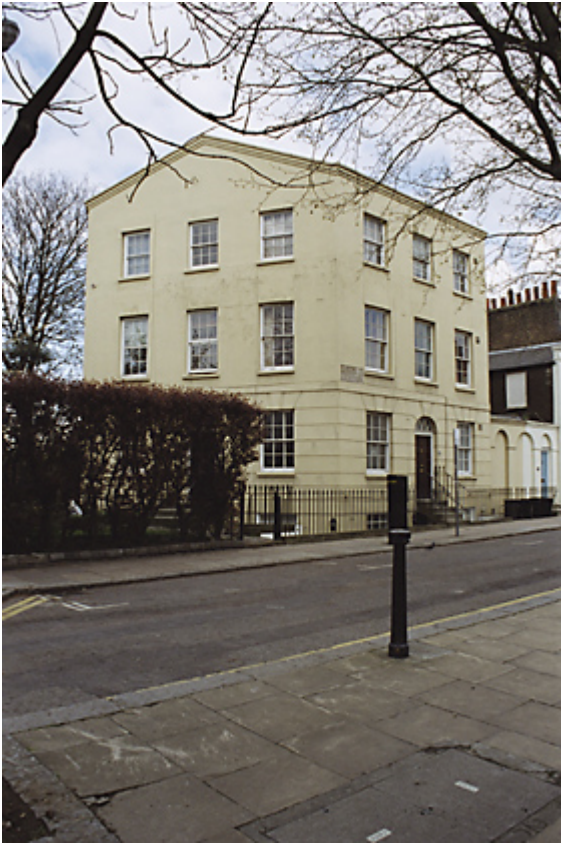
IoE Number: 478517 Location: NUMBERS 1 AND 1A AND ATTACHED WALL, 1 AND 1A JEFFREYS STREET (north side), CAMDEN TOWN, CAMDEN, GREATER LONDON Date Photographed: 09 April 2005 Date listed: 14 May 1974 Date of last amendment: 14 May 1974 Grade II CAMDEN TQ2884SE JEFFREY'S STREET 798-1/65/937 (North side) 14/05/74 Nos.1 AND 1A and attached wall (Formerly Listed as: JEFFREY'S STREET No.1) GV II Semi-detached house formed by the rear elevation of No.46 Kentish Town Road (qv). Early C19, partly rebuilt in facsimile 1971-2. Stucco with rusticated ground floor and plain 1st floor band. 3 storeys and basement. 3 windows. Round-arched doorway with fluted surround, fanlight with intersecting tracery and panelled door. Recessed sashes. Parapet with moulded coping. INTERIOR: not inspected. SUBSIDIARY FEATURES: attached blind arcaded wall with moulded coping to right forming a screen with the side portico of No.3 (qv).

2 pairs linked semi-detached houses. Early C19. Stucco fronts with brick returns. Slated pitched roofs with central tall slab chimney-stacks. 2 storeys and basements. 3 windows, central bays blind. Entrances in round-arched side porticoes linked by central blind arch to form arcaded screens. Square-headed doorways with reeded jambs, cornice-heads and panelled doors. Recessed sashes. Gable ends with moulded coping and plain band forming pediments. INTERIORS: not inspected. SUBSIDIARY FEATURES: attached cast-iron railings with urn finials to areas. (Survey of London: Vol. XIX, Old St Pancras and Kentish Town (St Pancras part II): London: -1938: 49)