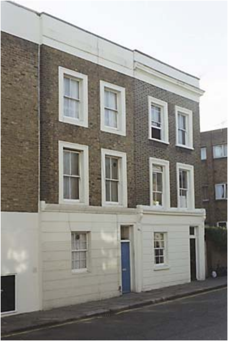
IoE Number: 477887 Location: 6 AND 8 GREENLAND ROAD (south side), CAMDEN TOWN, CAMDEN, GREATER LONDON Date Photographed: 30 October 2004 Date listed: 14 May 1974 Date of last amendment: 14 May 1974 Grade II

CAMDEN TQ2983NW GREENLAND ROAD 798-1/77/701 (North side) 14/05/74 Nos.7-41 (Odd) and attached railings GV II Terrace of 18 houses. Mid C19, restored c1976 as a GLC renovation scheme. Yellow stock brick with rusticated stucco ground floor and plain stucco 1st floor band. Nos 11-21 and 31-43 slightly projecting. 3 storeys and basements. 2 windows each. Square-headed, recessed doorways with pilaster-jambs carrying cornice-heads; fanlights and panelled doors. Recessed sashes; ground floor of No.7 with good cast-iron window guard, upper floors architraved: Nos 7 & 9 with cornices to 1st floor. Cast-iron balconies to 1st floor windows. Stucco cornice and blocking course except Nos 9, 19 & 21 and 37-41 where the cornices have been cut back. INTERIORS: not inspected. SUBSIDIARY FEATURES: attached cast-iron railings with bud finials to areas.