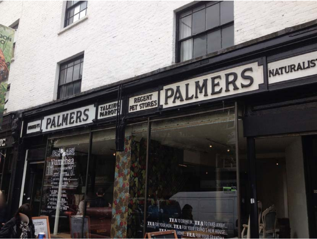
IoE Number: 505028 Location: PALMERS PET STORES, 35-7, PARKWAY, CAMDEN TOWN, CAMDEN, GREATER LONDON Date photographed: June 2013 Date listed: 31-Jul-2007 Grade II

Arlington House, formerly the Camden Town Rowton House opened in 1905, was recommended for listing at Grade II for the following principal reasons: * Architectural: an imposing landmark of a thoughtful design with richly detailed terra cotta dressings and distinctive roofscape; its scale and attention to detail reflect both its function and the idealism of its origins. * Historical: the last and largest of London's well-known Rowton Houses, built to provide accommodation for single men in the late C19 and early C20. Its origins and development through the C20 illustrate a little-recognised aspect of working-class history. * State of external preservation: the best-preserved of London's Rowton Houses, representing Measures' recognisable Rowton House design. Recent restoration work has further revealed the quality of its elevational treatment. The interior is now much altered to suit modern requirements, but the plan and character of the arched corridors survives. * Comparative quality and significance: it matches the interest of one other former men's hostel designed by Measures in Birmingham (Grade II), the two listed LCC men's hostels of the period (Carrington House and Bruce House, both Grade II) and the listed women's equivalent, Ada Lewis Women's Lodging House (Grade II).