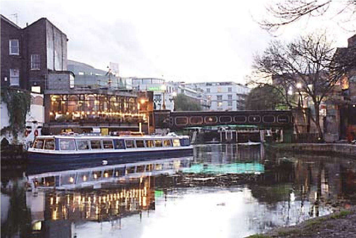
IoE Number: 476806 Location: HAMPSTEAD ROAD BRIDGE OVER GRAND UNION CANAL, CAMDEN HIGH STREET , CAMDEN TOWN, CAMDEN, GREATER LONDON Date Photographed: 04 December 2005 Date listed: 11 January 1999 Date of last amendment: 11 January 1999 Grade II

CAMDEN TQ2884SE CAMDEN HIGH STREET 798-1/65/151 Hampstead Road Bridge over Grand Union Canal GV II Public road bridge over the Grand Union Canal and towpaths. 1876, replacing an earlier inadequate brick bridge of c1815. Provided by the St Pancras Vestry and the Metropolitan Board of Works. Slightly cambered cast-iron girder bridge. Cast-iron panelled parapets with relief moulded rectangles; similar parapets on bridge deck provide pedestrian walkways. Brick abutments with stone coping. Stone plaque in north-east abutment recording the rebuilding.