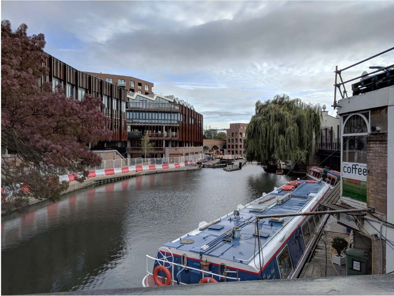
View 9. View from Camden High Street bridge looking at the Hawley Wharf development on the left.