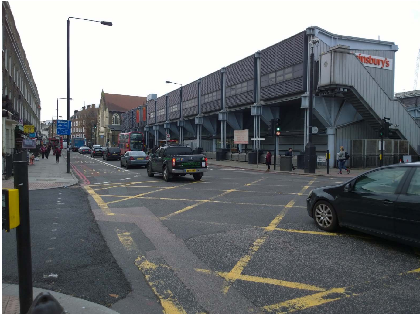
View 15. View south along Camden Road from the junction with Lyme Street. Grimshaw's supermarket can be seen in the foreground. While the Sainsbury's responds in height and width of the bays of the Georgian terrace opposite, its modern character is instantly recognisable.