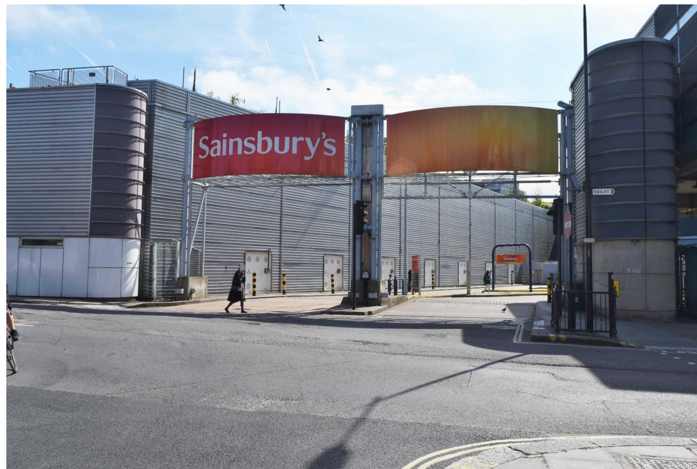
View 18. View of the main entrance to Sainsbury's car park.