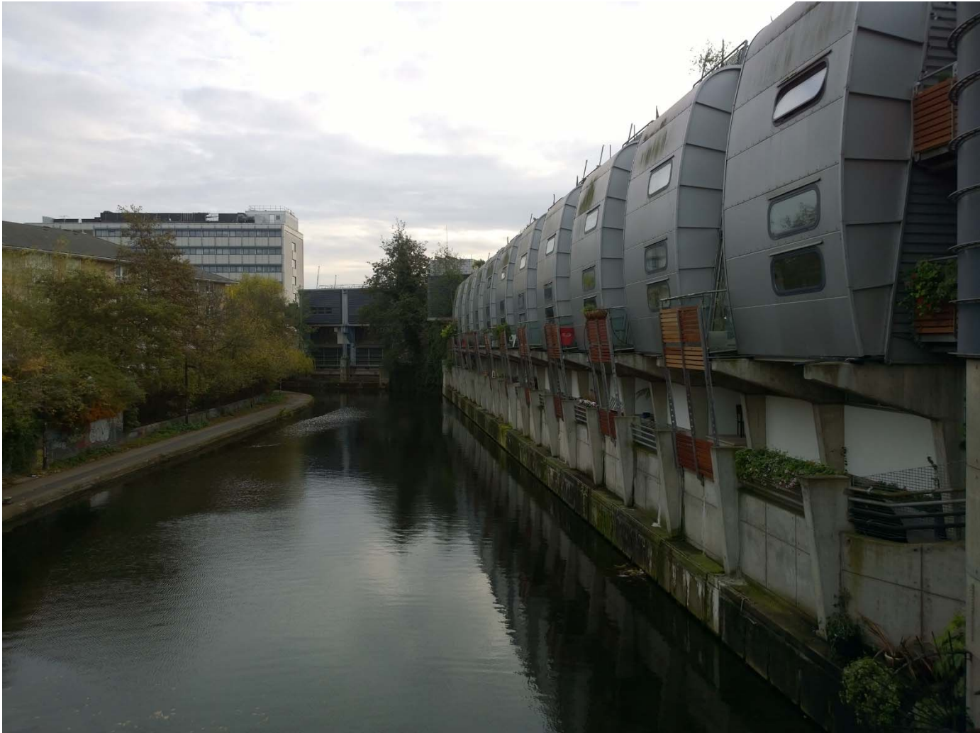
View 8. View of Grimshaw's canal-side housing from Kentish Town Road Bridge. The British Transport Building can be seen in the background on the left of the image.