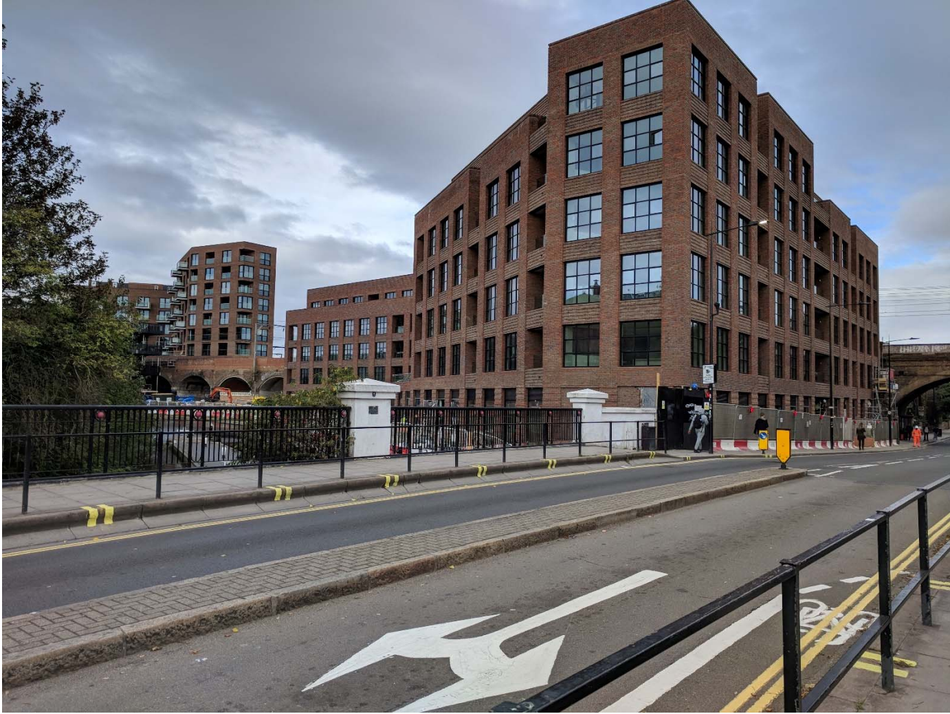
View 10. View from Kentish Town Road bridge looking at the eastern end of the Hawley Wharf development.