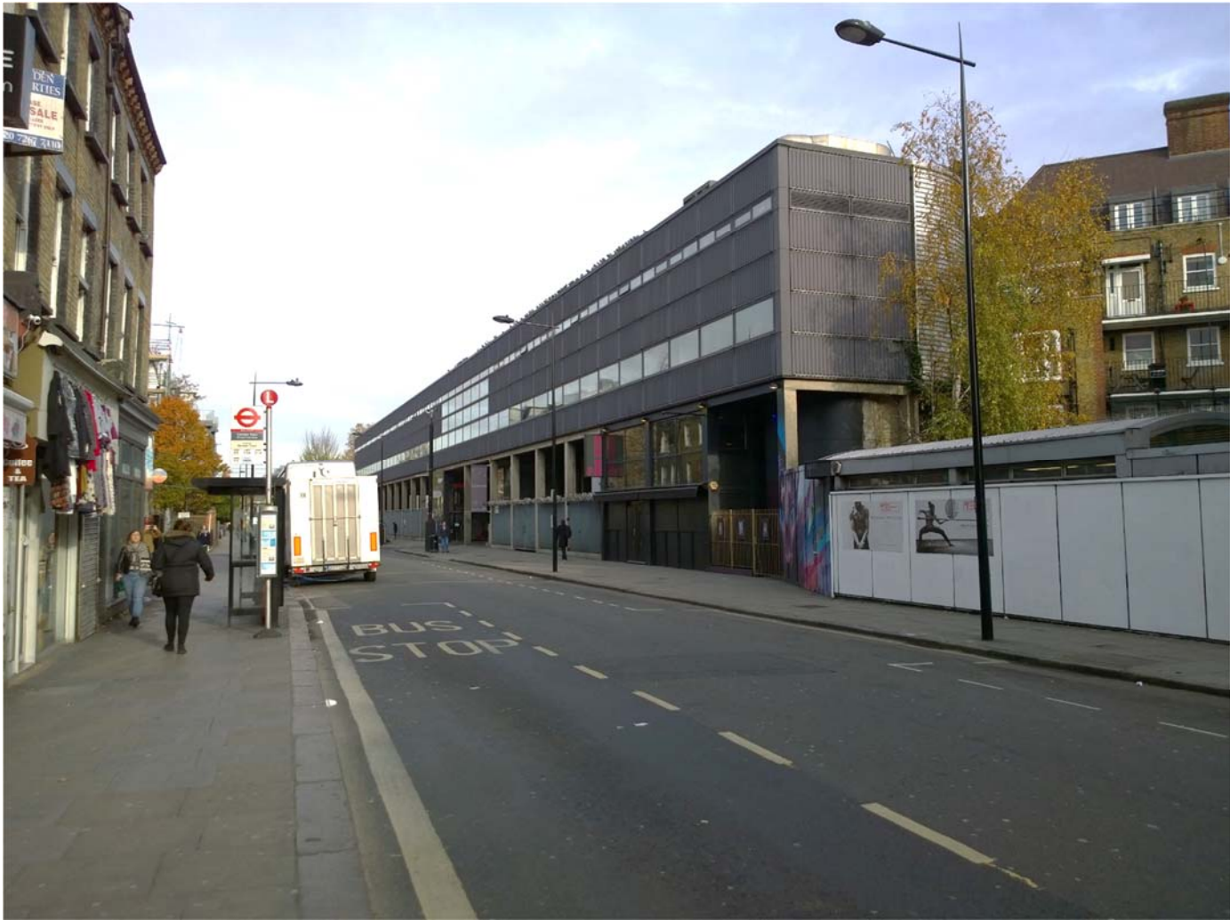
View 13. View north from the western pavement on Kentish Town Road with the one storey nursery building in the foreground and the long elevation of the GUH extending along the Road.