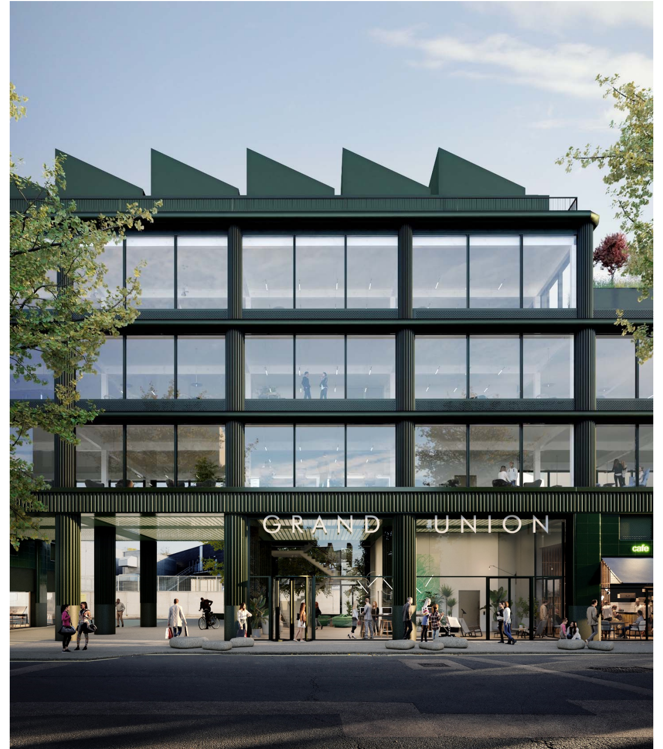
Grand Union House, London NW1 Heritage Statement: Appendix B December 2018