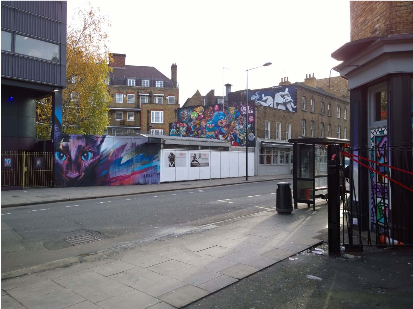
View 14. View of the nursery building (disused) from the western pavement of Kentish Town Road. The terrace joining the nursery in the south remains within the Camden Town Conservation Area.