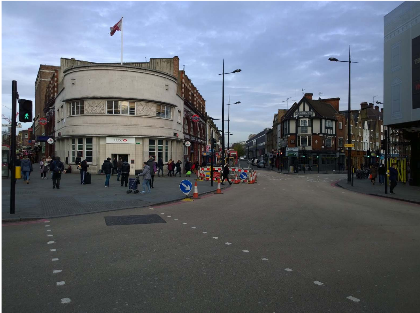
View 4. View north from the Britannia Junction with Camden High Street remaining left of the HSBC bank (no 176) and Kentish Town Road right of it. The building is a good example of post-war architecture, dating from c. 1950s and despite being 2 storeys is a strong focal point visible in long views from the south. The GUH is visible on Kentish Town Road to its right.