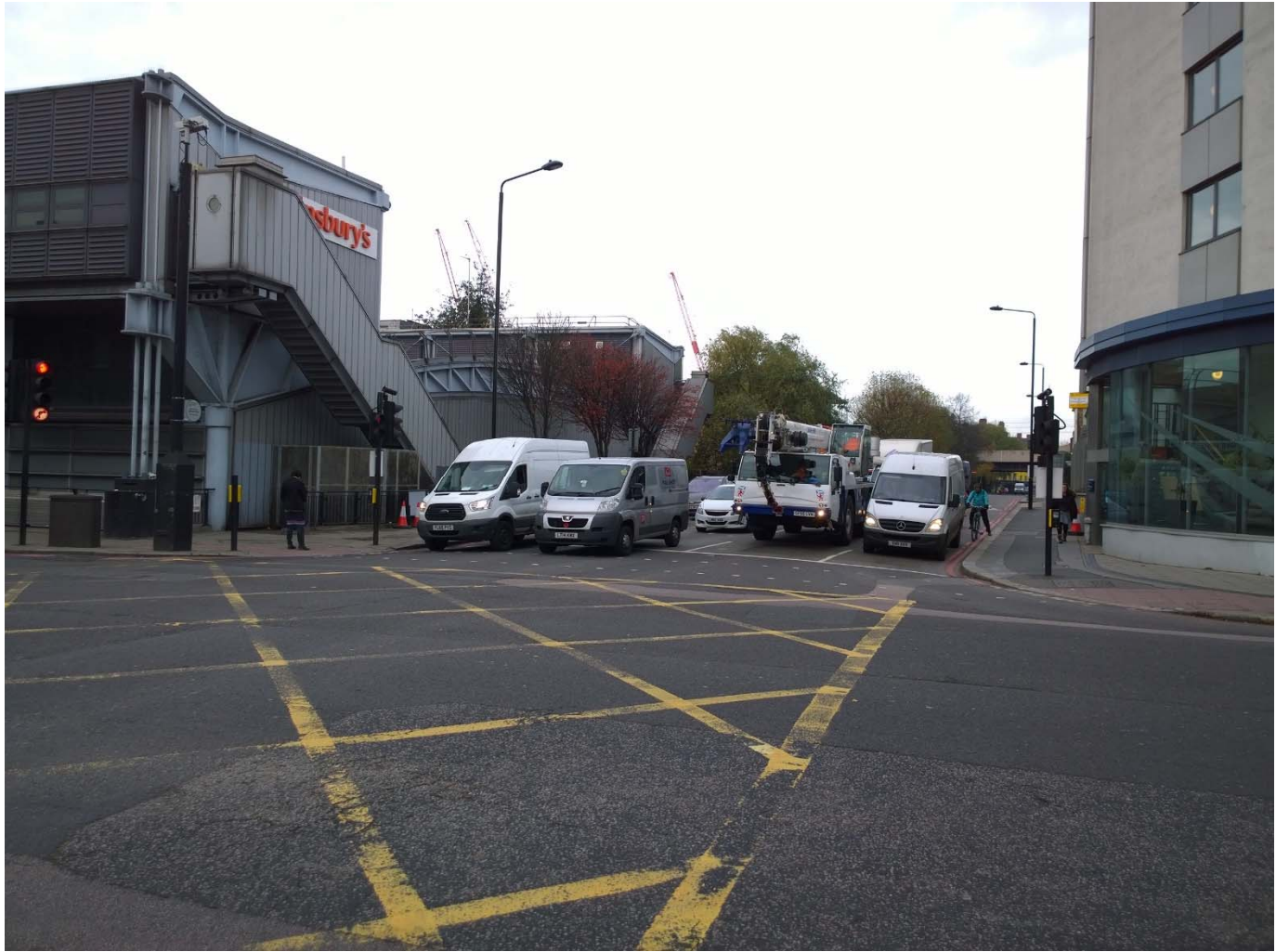
View 6. View NW along Camden Street with the rear elevation (north elevation) of the Sainsbury's supermarket visible in the foreground.