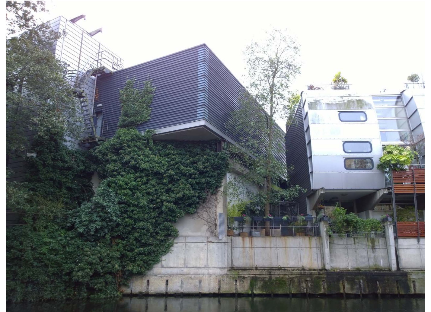
View 16. View of the rear elevation of Sainsbury's and the adjoining canal-side terrace.