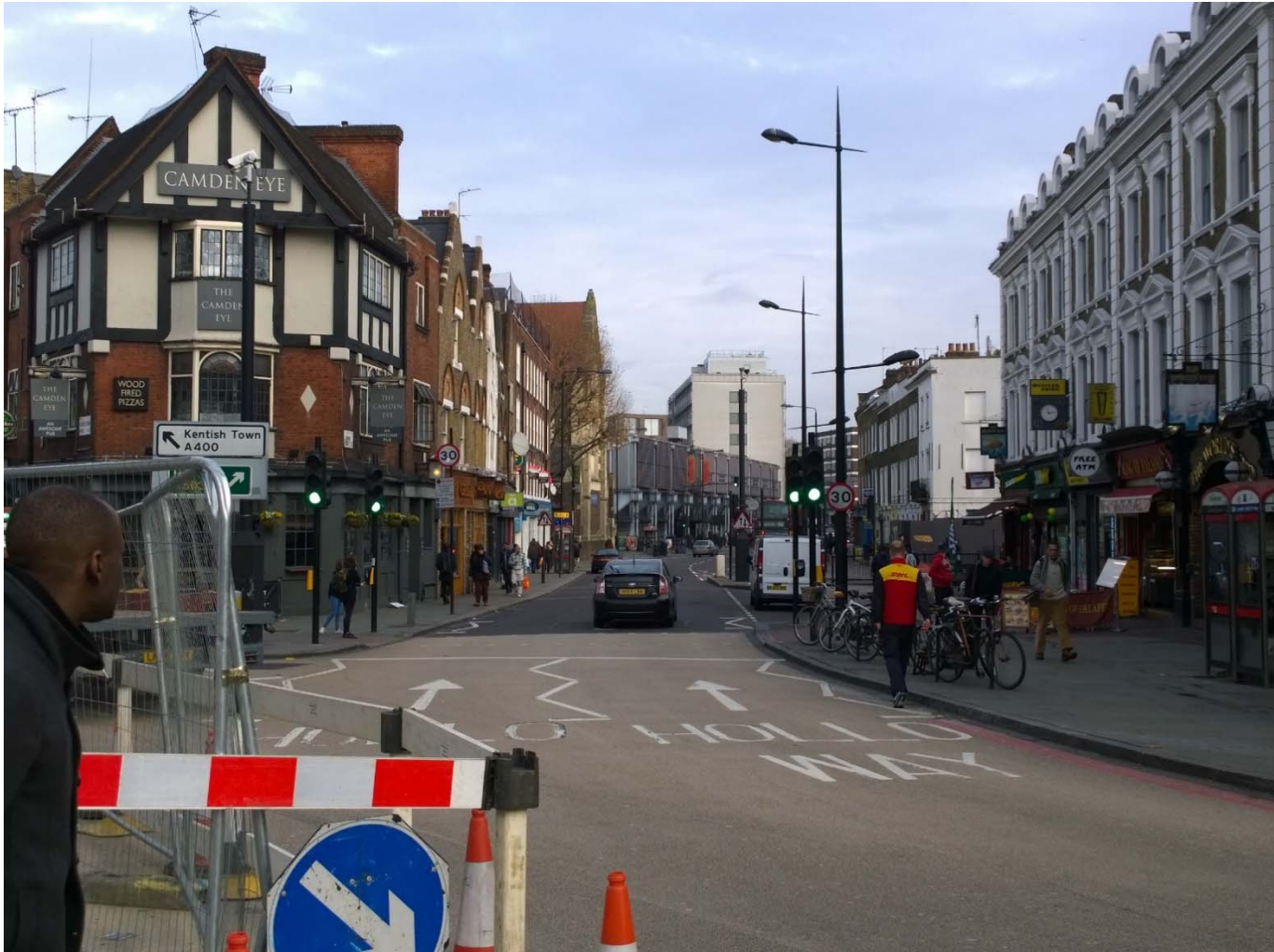
View 3. View NE from the Britannia Junction along Camden Road with Sainsbury's supermarket visible in the distance on the left. The 7 storey British Transport Building is visible above the supermarket.