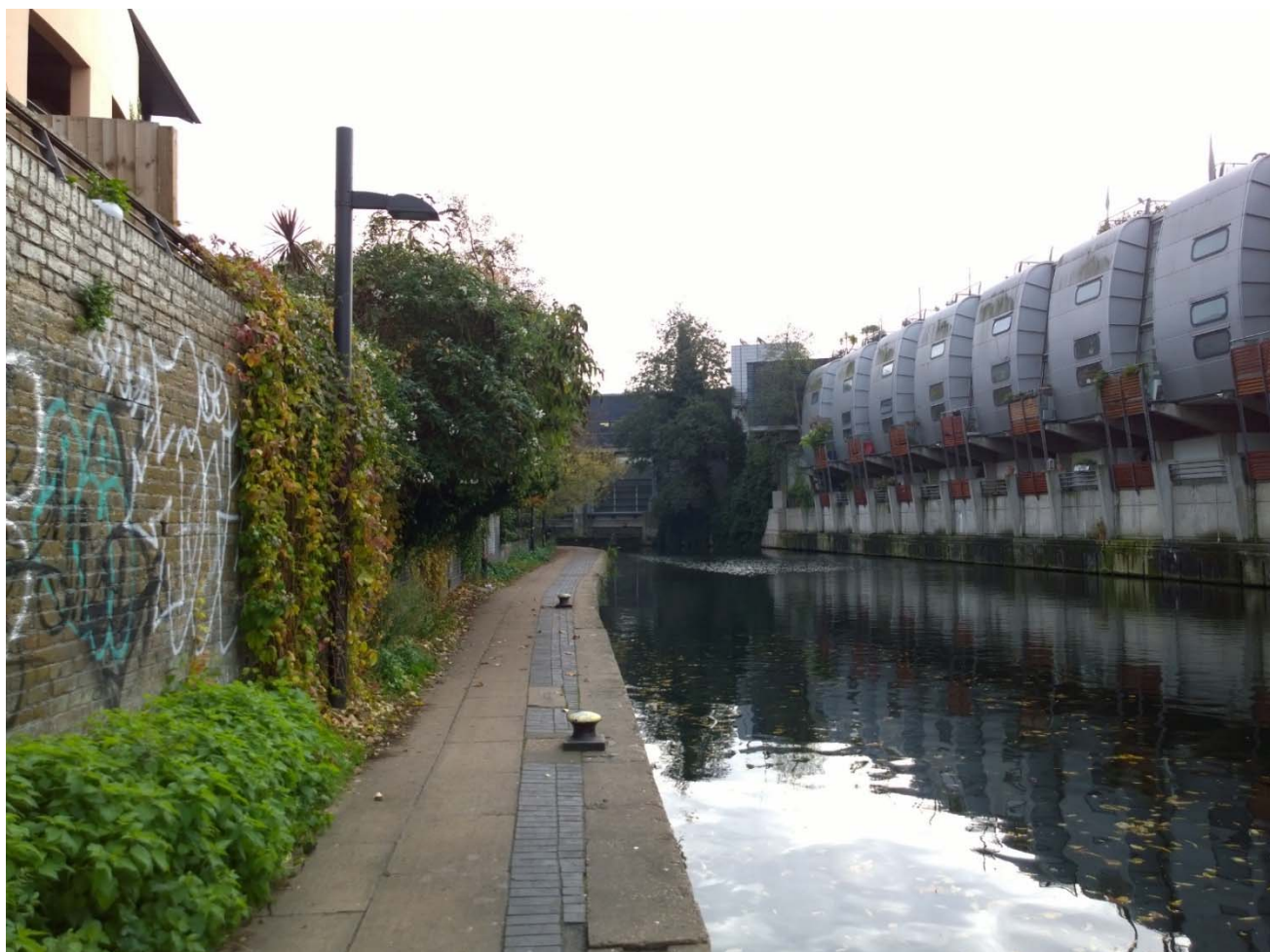
View 17. View of the canal-side housing and rear elevation of Sainsbury's from the footpath along Regent's Canal.