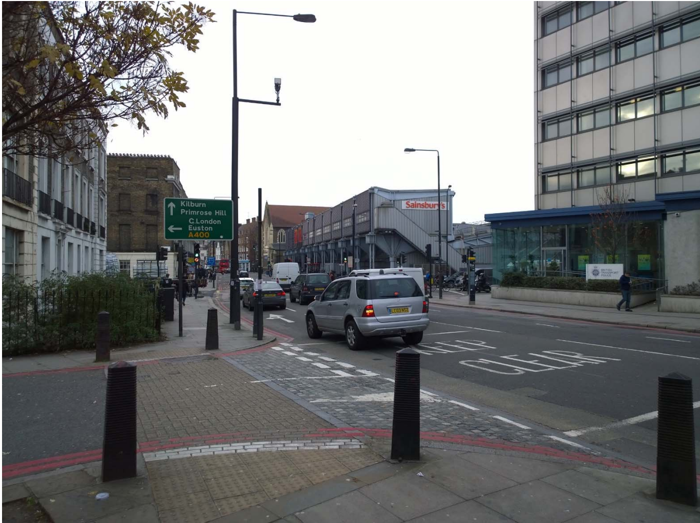
View 5. View SW along Camden Road from the corner of Camden Road and Lyme Street with Sainsbury's supermarket visible on the right. The tall building in the foreground is the British Transport Building.