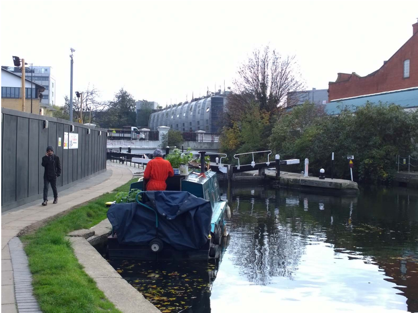
View 7. View east along Regent's Canal footpath with the canal-side housing by Grimshaw visible in the distance.