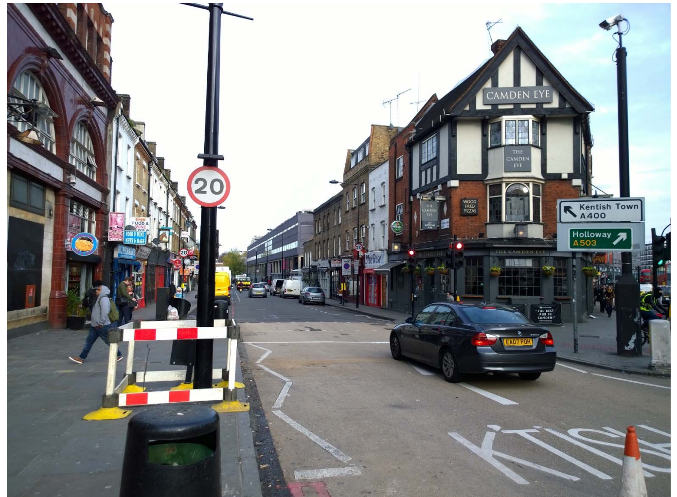
View 2. View north from the Britannia Junction up Kentish Town Road with the Grand Union House visible in the distance.