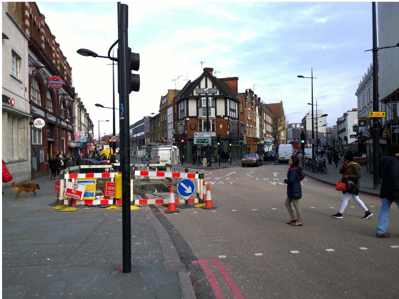
View 1. View from the Britannia Junction looking north with Kentish Town Road on the left and Camden Road on the right. The Sainsbury's supermarket is visible on the western side of Camden Road in the distance.