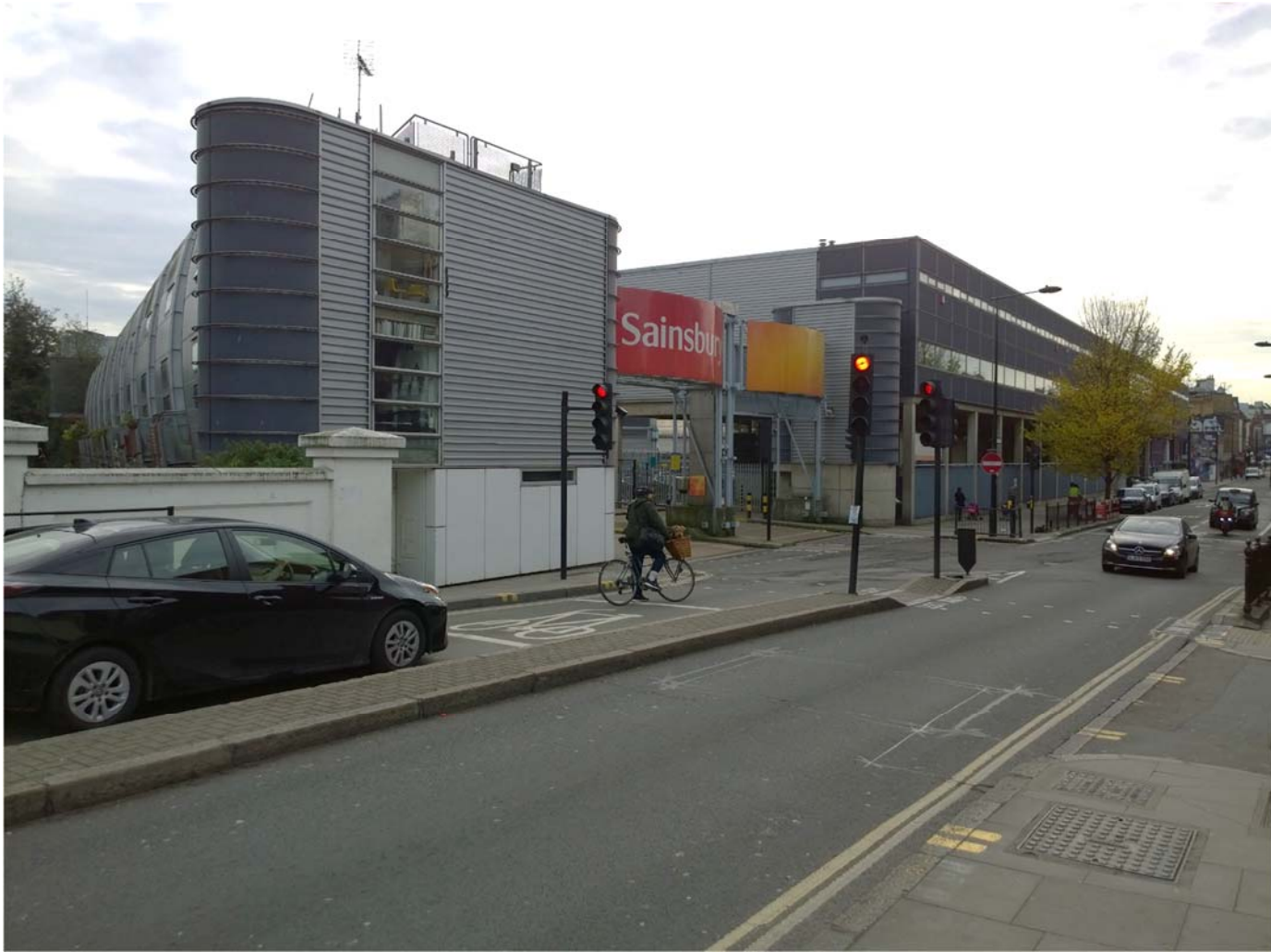
View 12. View from Kentish Town Bridge at the west elevation of the canal-side terrace. The long street elevation (approximately 100m) of the GUH can be seen further south along the street.