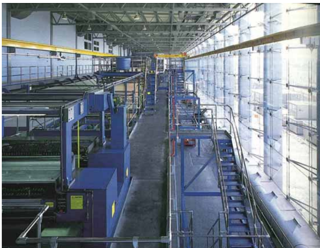
Figure 77. 1987-88: Financial Times Printworks, East India Dock House, London by N. Grimshaw (listed Grade II*).