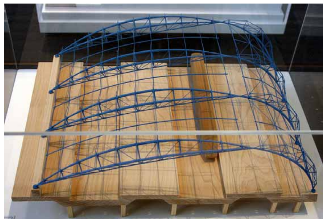
Figure 78. 1992: Rail Terminal at Waterloo by N. Grimshaw (not listed, SAVE Britain's Heritage and C20 Society submitted an application for listing in 2016 following the proposals to transform part of the former Eurostar terminal at Waterloo into shops. However, HE did not list the building.