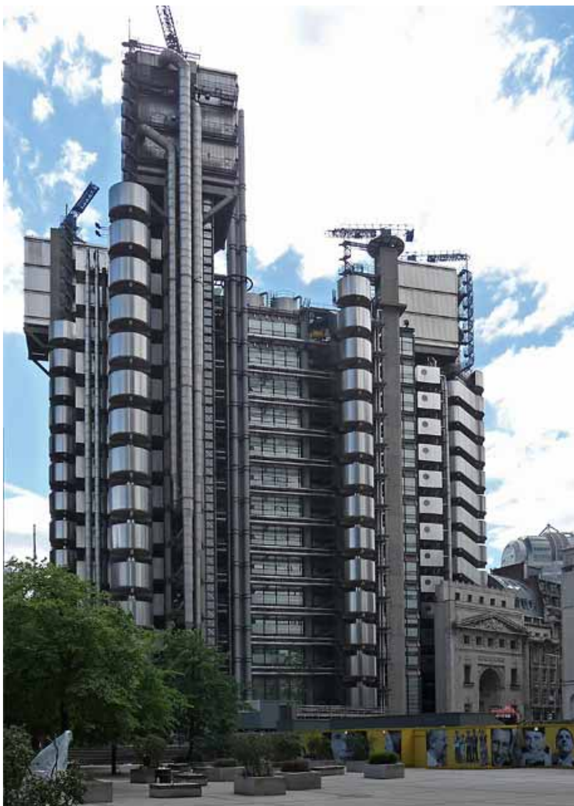
Figure 76. 1986: Lloyd's London by Richard Rogers