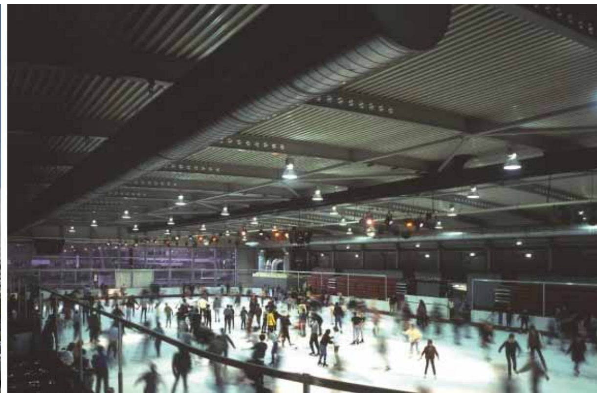
Figure 73. 1984: Oxford Ice Rink by N. Grimshaw (application for listing submitted by C20 Society in 2016, HE decided not list the building). Source: http://manchesterhistory.net/architecture/1980/icerink1.jpg