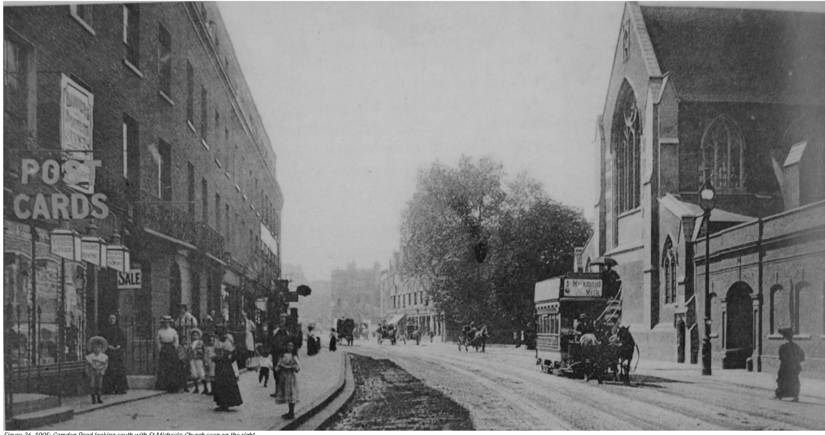
Figure 36. 1905: Camden Road looking south with St Michael's Church seen on the right.