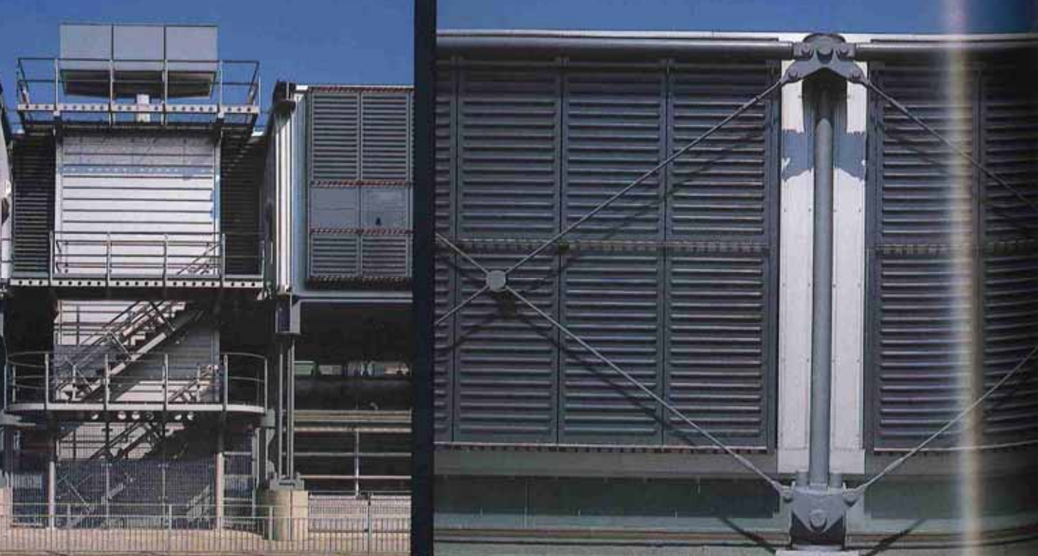
Figure 37. 1989: Sainsbury's by N. Grimshaw shortly after opening