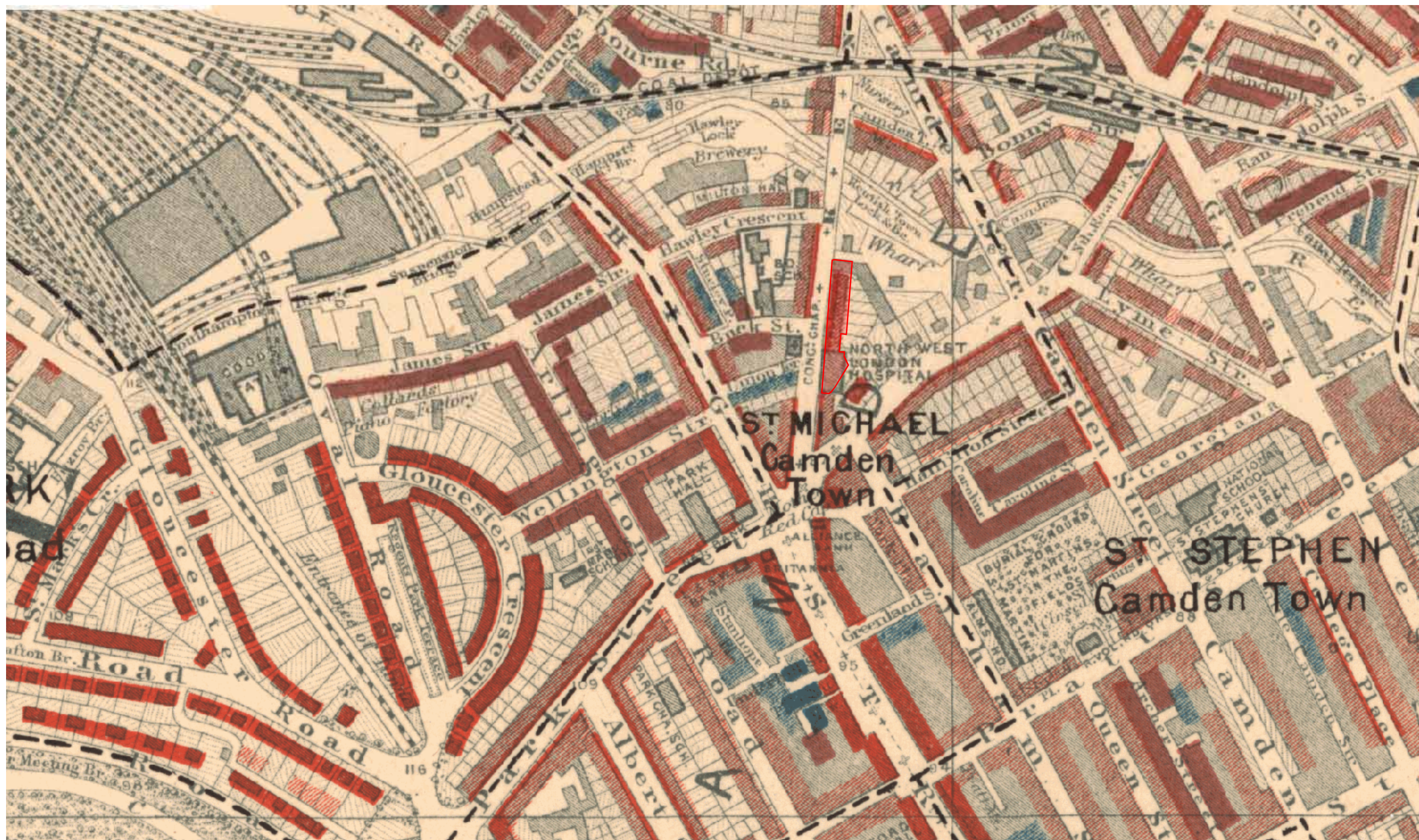
Figure 9. 1889: Booth's Map of London, approximate locations of site marked in red.