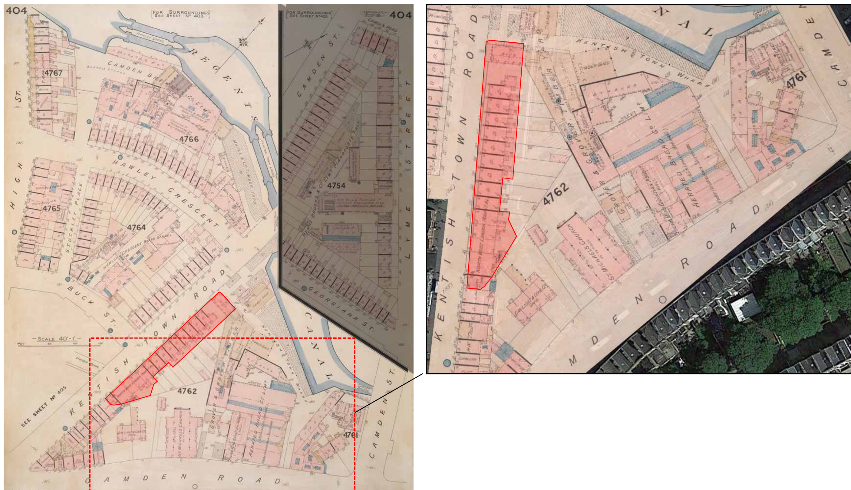
Figure 10. 1891: Insurance Plan of London (Vol XI: Sheet 404-1), approximate locations of site marked in red.